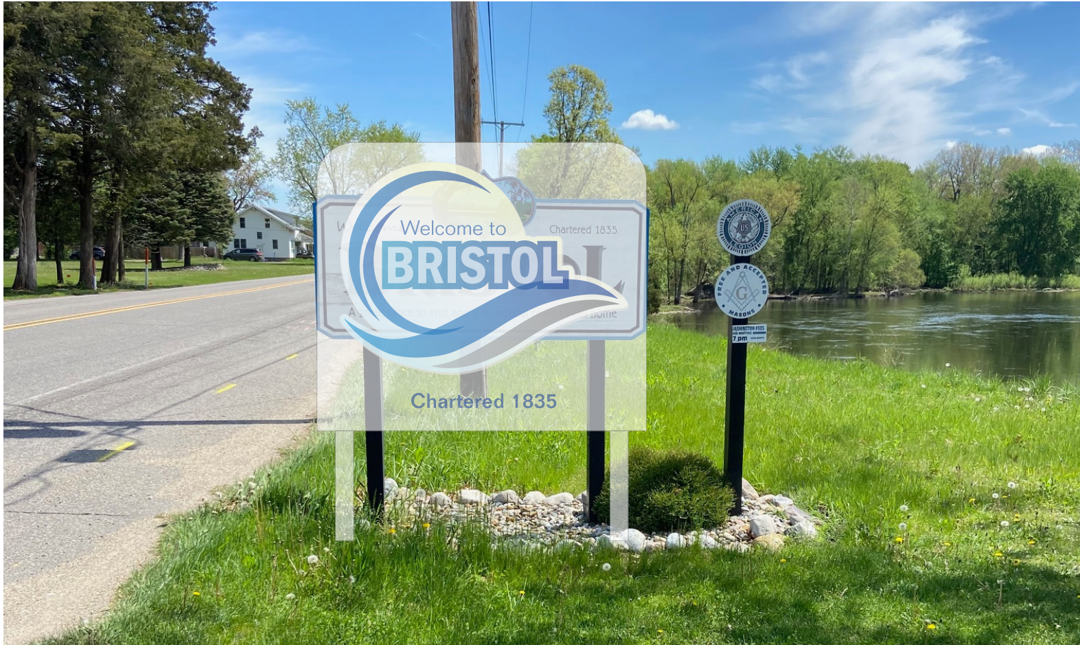
Comparison @ Smaller Existing Signs