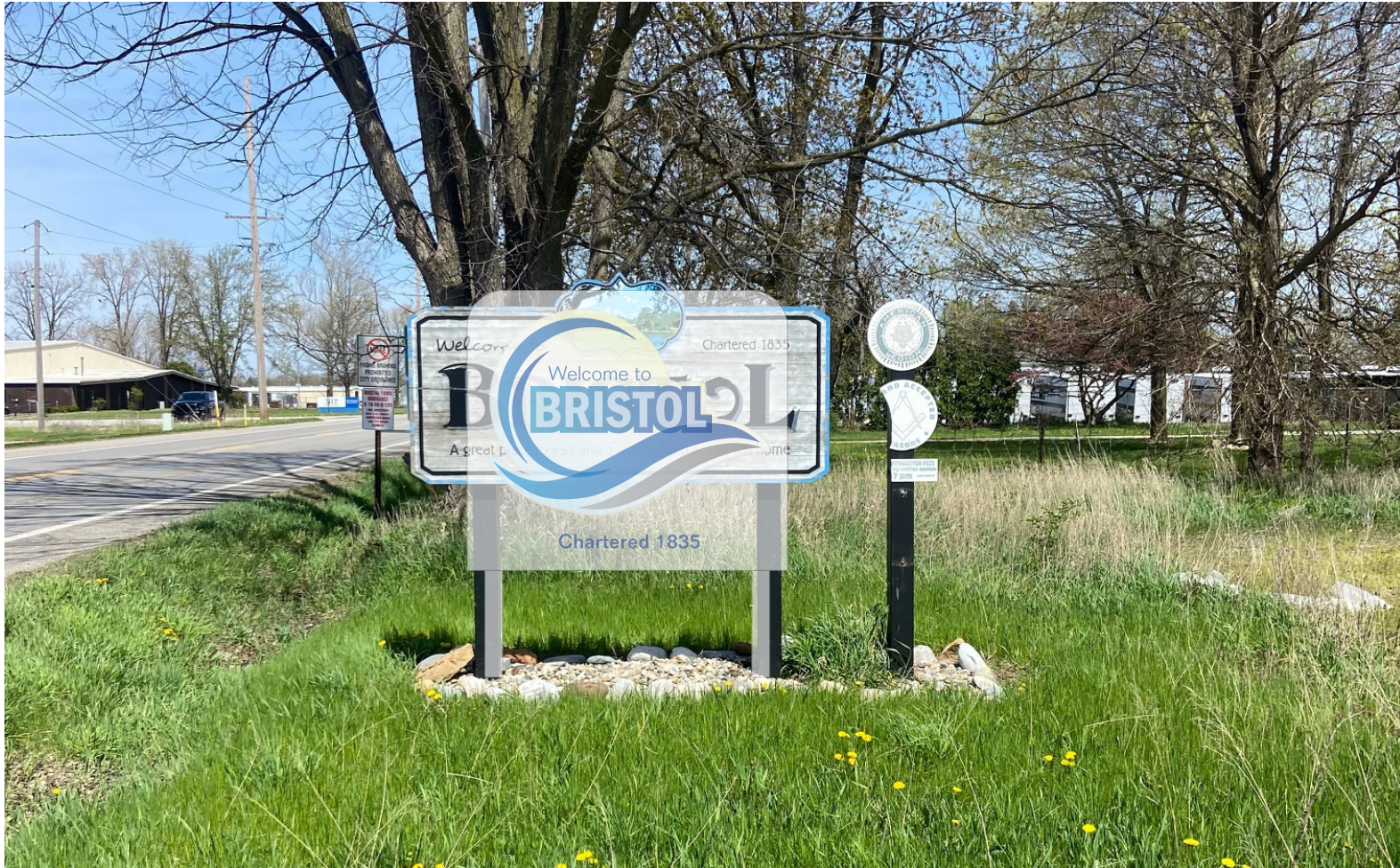
Comparison @ Larger Existing Signs