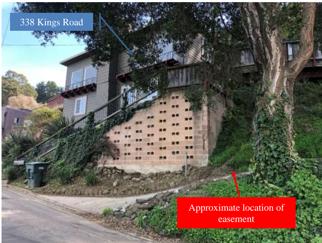
Below: View of the property from Kings Road looking southeast