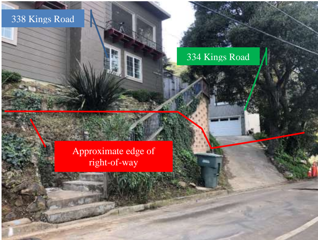
Above: View of the property from Kings Road looking west