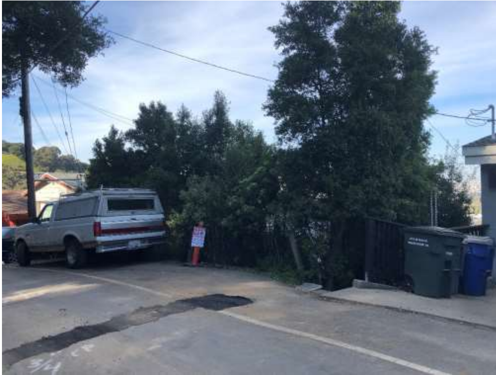
Above: Area of on-street parking improvement (two spaces) between 333 and 339 Kings Road.