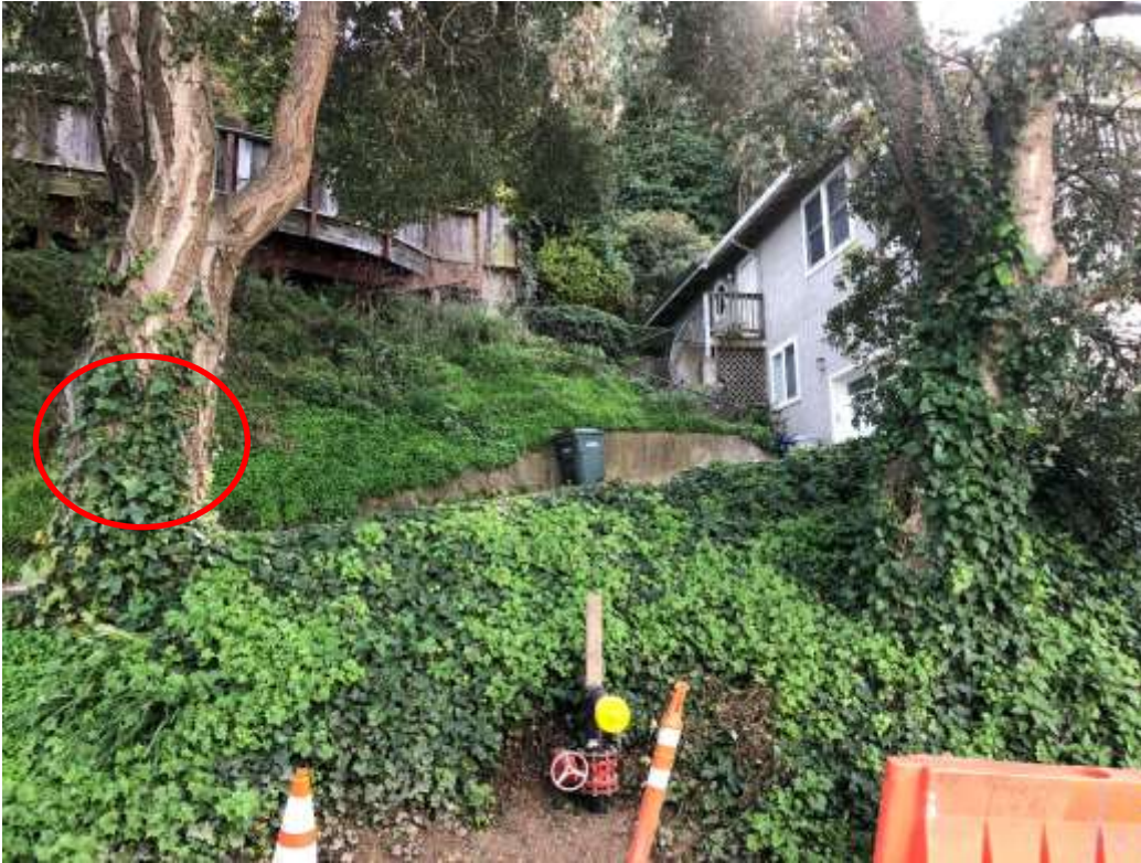
Above: Street tree to be removed to accommodate driveway and street widening