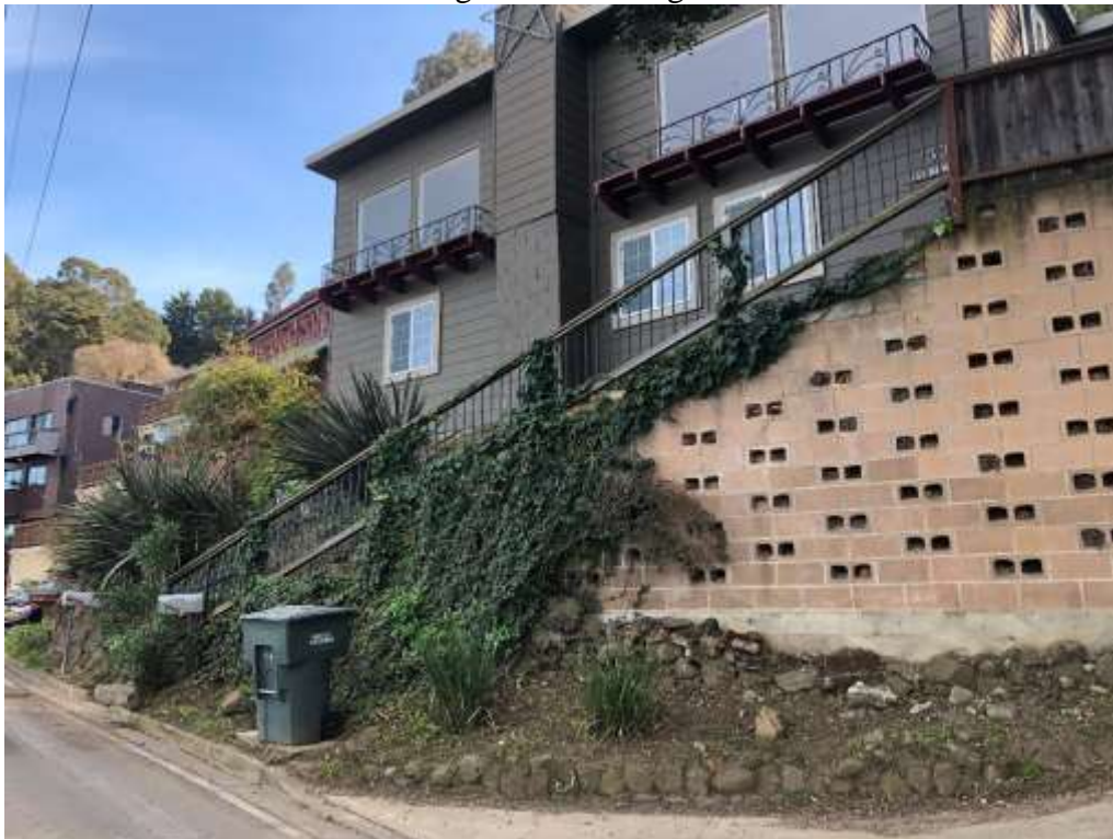
Below: View of home from Kings Road looking west