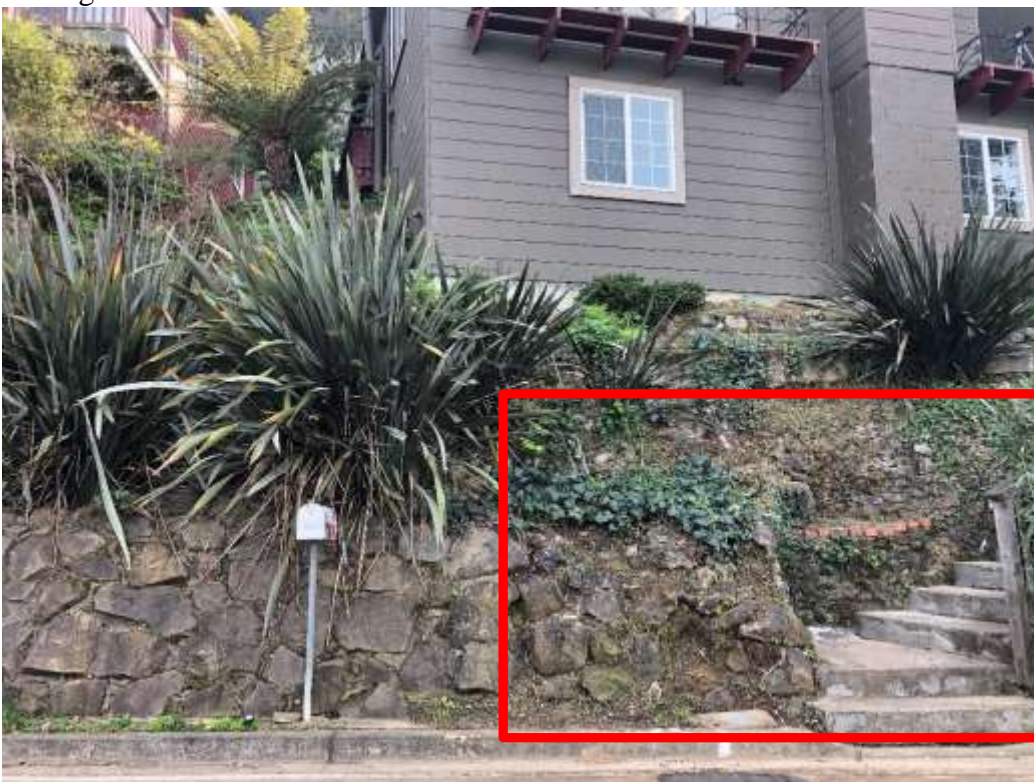
Below: Approximate location of proposed new on-street parking space within property frontage