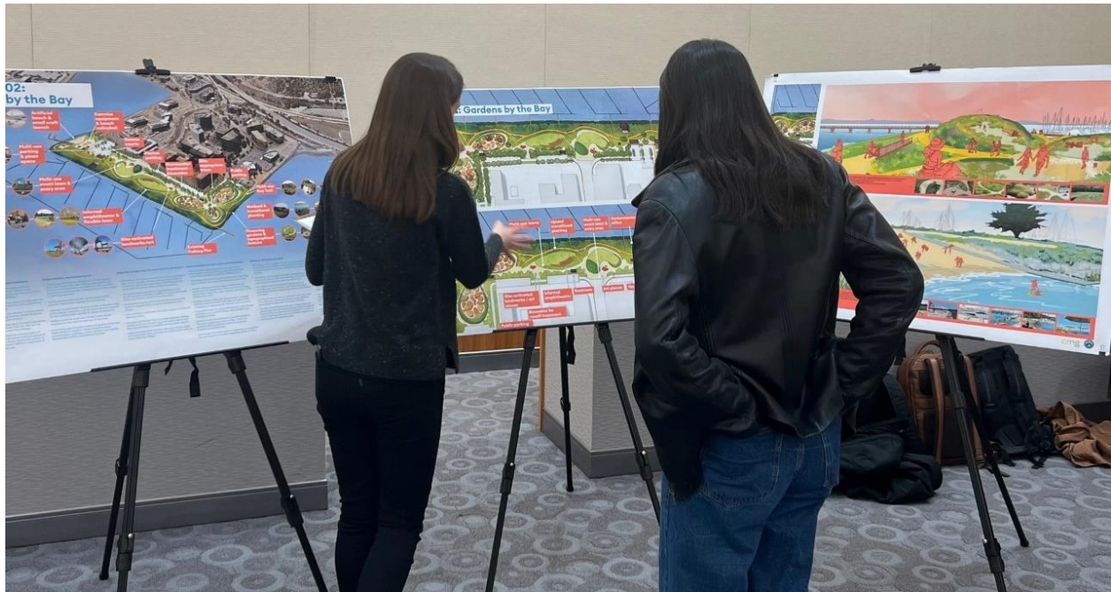
Sierra Point Open Space and Parks Master Plan Community Workshop