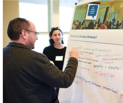
March 21, 2019 Community Conversation