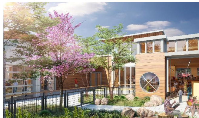
Rendering of Brisbane Library