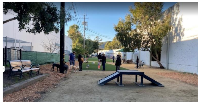
Dog Park Resurfaced