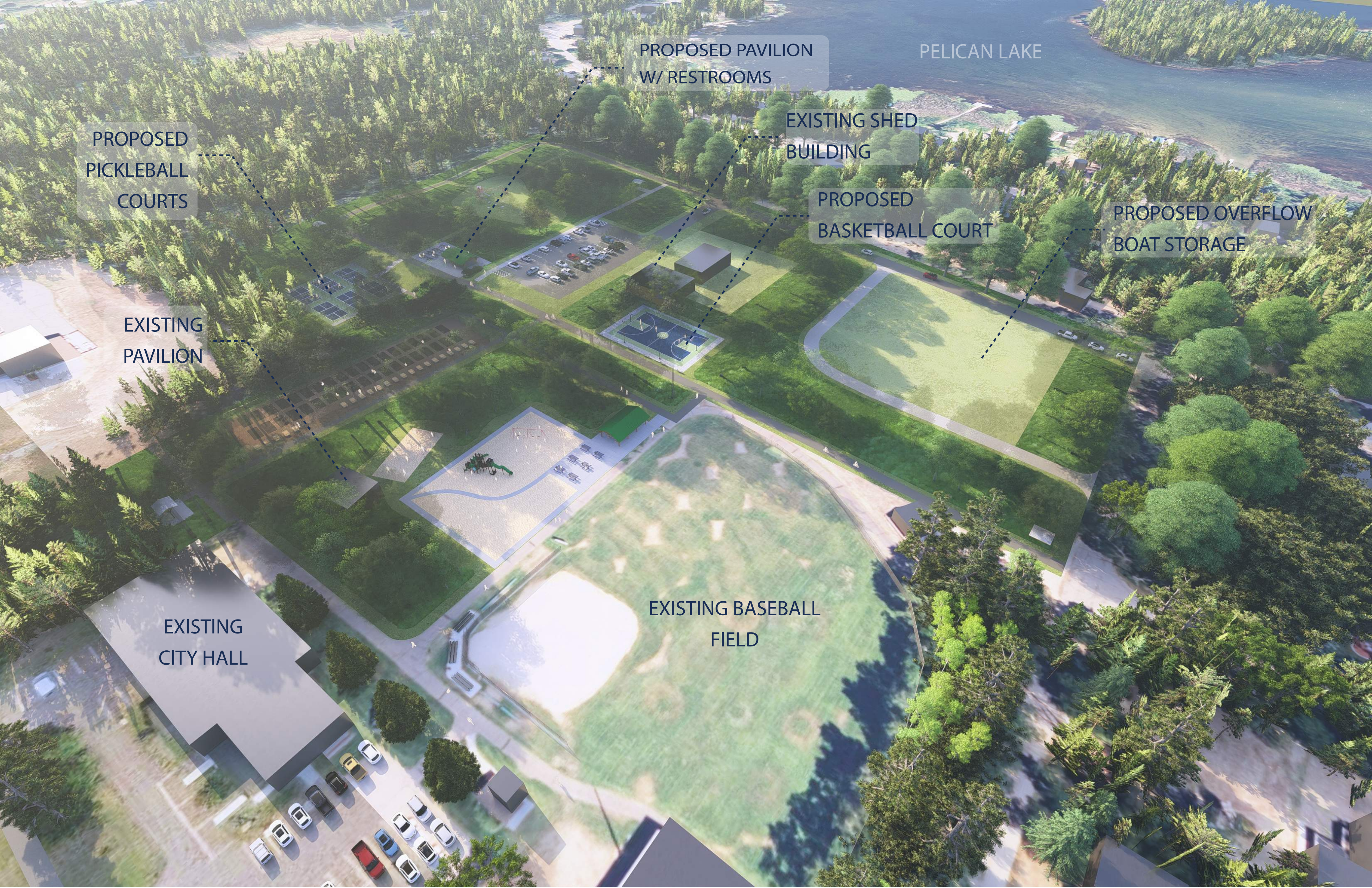
P1 PERSPECTIVE 1