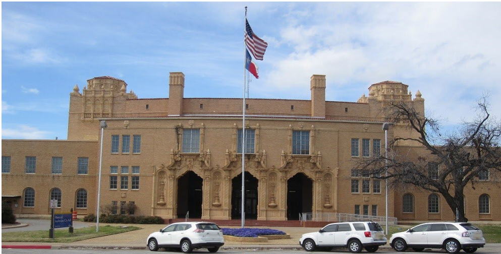
Wichita Falls, TX City Offices and Memorial Auditorium