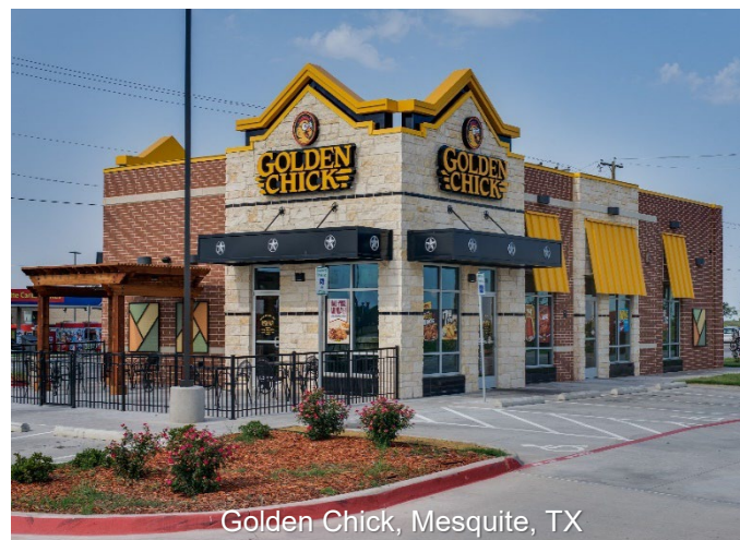
Golden Chick, Mesquite, TX