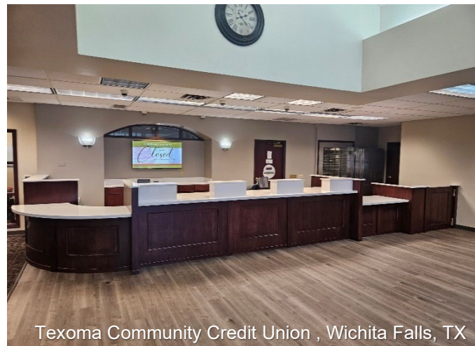
Texoma Community Credit Union , Wichita Falls, TX