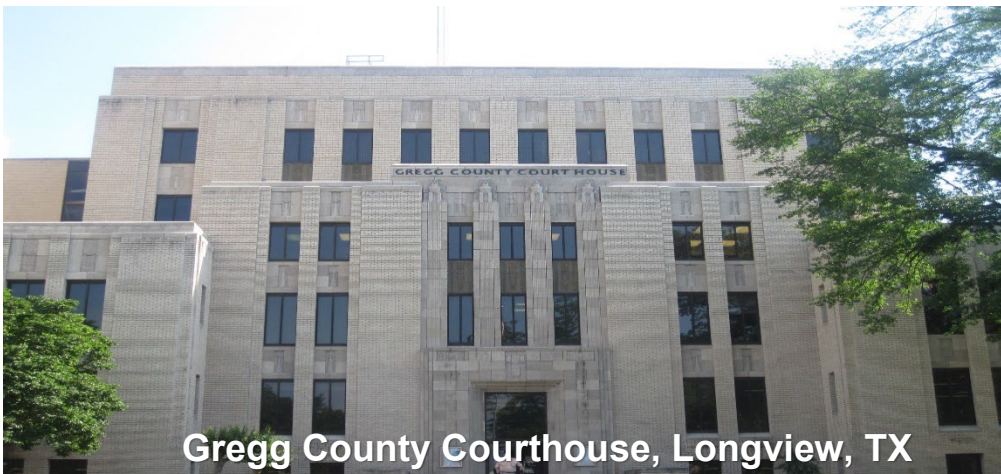
Gregg County Courthouse, Longview, TX