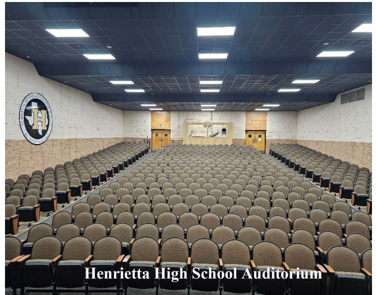
Henrietta High School Auditorium