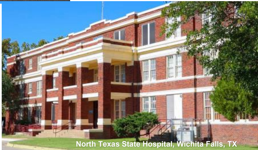
North Texas State Hospital, Wichita Falls, TX

The North Texas State Hospital in Wichita Falls, TX was originally designed by Voelcker & Dixon in 1938. GBA Architects have done several renovations on the campus over the years along with GB Construction. We have recently completed 3 renovation projects that included elevator work, interior and exterior renovations of several buildings and the design of new gated drive through, security office, and new fencing.