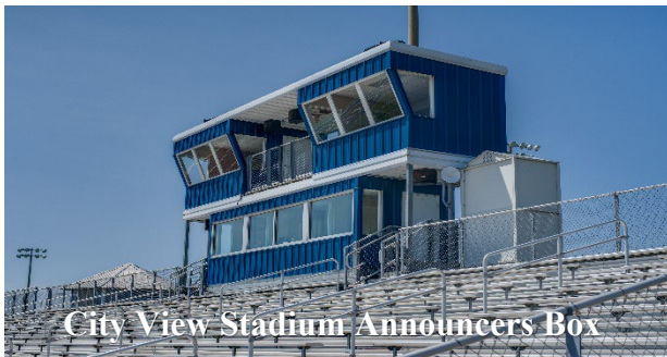
City View Stadium Announcers Box