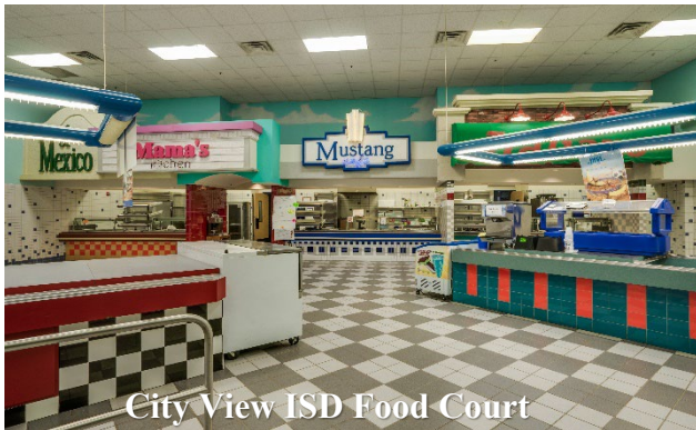
City View ISD Food Court