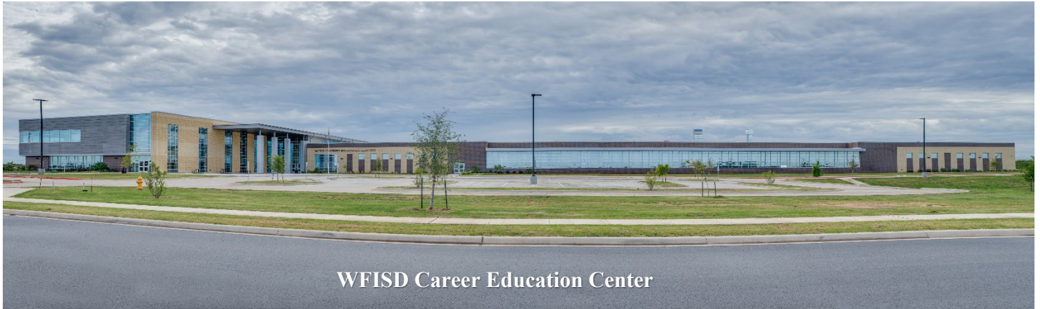
WFISD Career Education Center