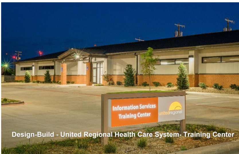
Design-Build - United Regional Health Care System- Training Center

The URHCS Training Center is a 10,000 square foot facility that was a GBA Architects and GB Construction Design-Build Project. It contains several training rooms, break room, and houses the electronic health records for the United Regional Health Care System.