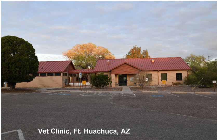
Vet Clinic, Ft. Huachuca, AZ

The Vet Clinic in Ft. Huachuca, AZ was a complete facility refurbishment of two veterinary clinic buildings that provided services for large and small animals. This refurbishment included a complete demolition and replacement of interior of both facilities with an addition of a covered walkway between each building along with a new roof. GBA Architects teamed up with Global Engineering, LLC for this Design-Build project.