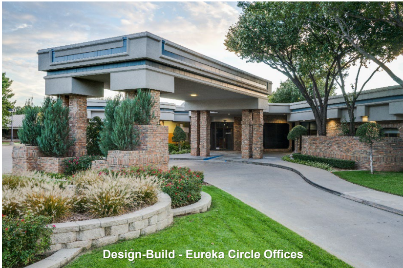
Design-Build - Eureka Circle Offices

Eureka Circle Offices were an original Design-Build project that was built as the offices for GBA Architects and GB Construction, along with several other businesses. We have since moved from this location and sold the property, but we continue to assist the current owners with any remodeling and maintenance projects that they may have.