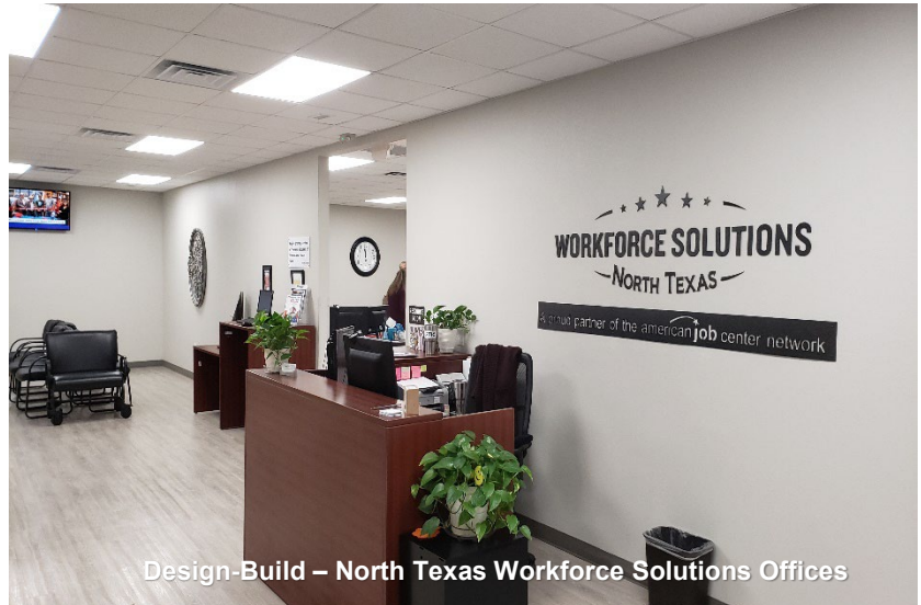
Design-Build – North Texas Workforce Solutions Offices

North Texas Workforce Solutions, housed in the Galaxy Building in Wichita Falls, TX was part of a Design-Build of the entire Galaxy Building. This project included the redesign and layout of several offices, public restroom additions, and complete remodeling. This building was built in the 1960's as Fedmart Department Store. Galaxy Oil bought the building in the 1970's and Staley & Associates (previous owners of GBA Architects) designed the Galaxy Oil Building. Since then, GBA Architects has been involved in Design-Build for the various owners and even completed the Design-Build for the GBA Architects office space.