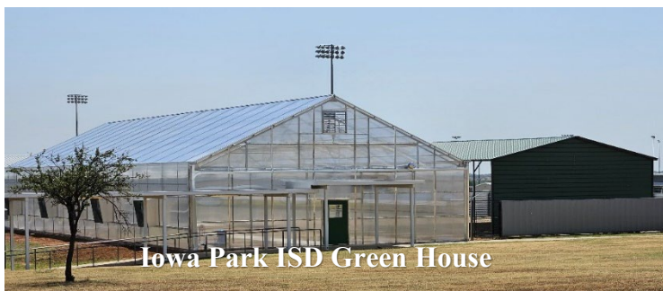
Iowa Park ISD Green House