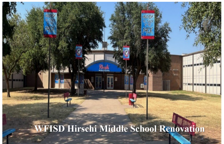
WFISD Hirschi Middle School Renovation