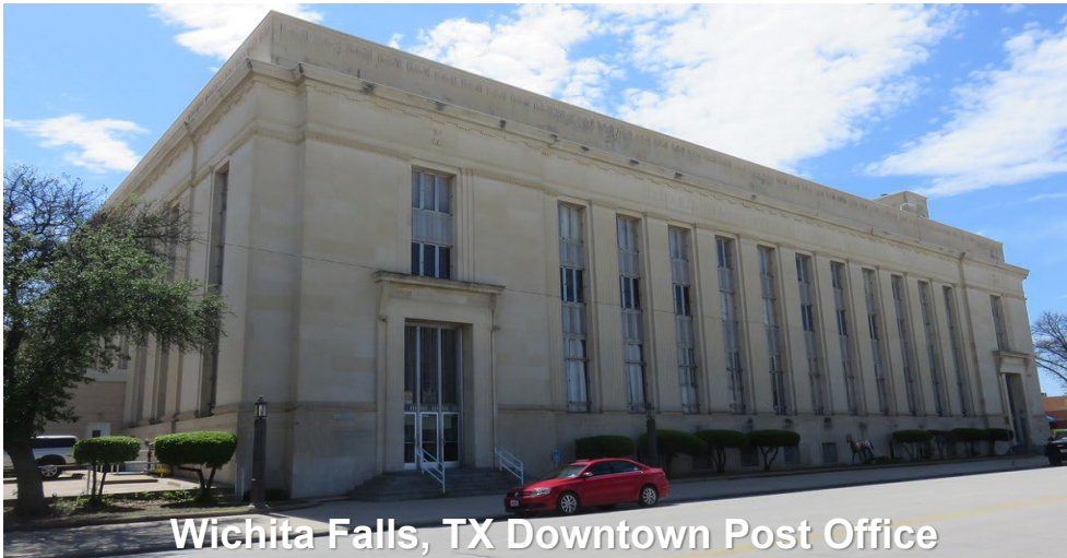
Wichita Falls, TX Downtown Post Office