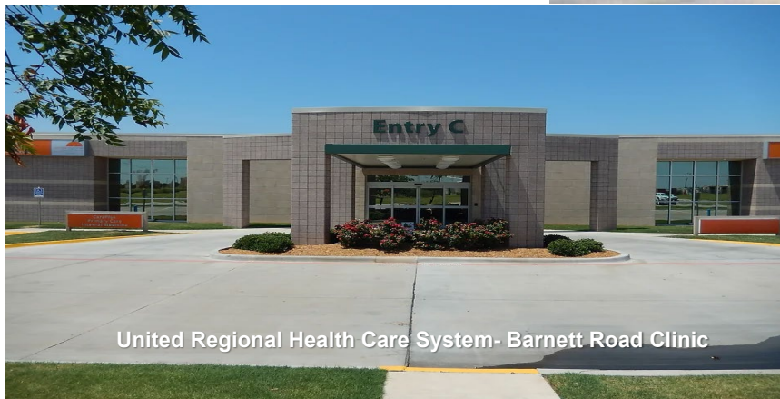
United Regional Health Care System- Barnett Road Clinic

The URHCS Barnett Road Clinic in Wichita Falls, is just one of many projects that GBA Architects have worked on for URHCS includes two new major additions and renovations. Other projects include the design build of the new EHR Training Center, renovations of various hospital, Cath Labs, Labor and Delivery remodel, Radiology Dark Room Remodel, Dr. Lounge Remodel, Parking lots, the Barnett Road Clinic, MRI Replacement and too many more to mention.