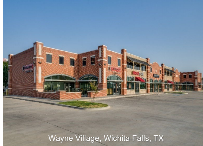
Wayne Village, Wichita Falls, TX