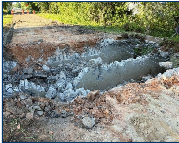
Resilient Stormwater Park Contractor removing existing box culvert on Moody Street.