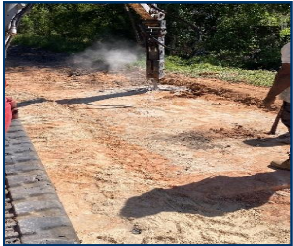
Resilient Stormwater Park Contractor demoing concrete pad on Moody Street.