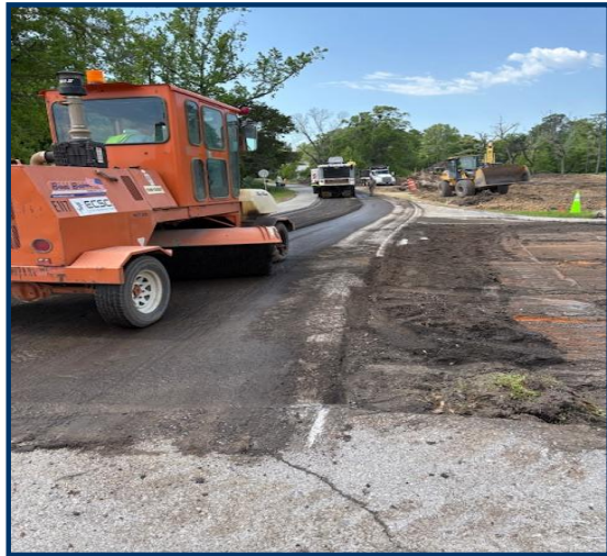
Resilient Stormwater Park Contractor milled up existing asphalt on Moody Street