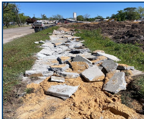
Resilient Stormwater Park Contractor loading and hauling off material from job site.