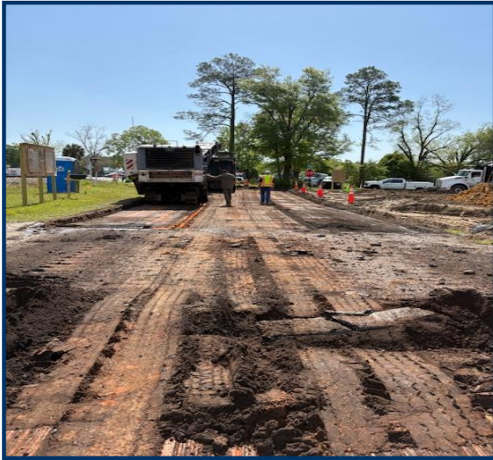
Resilient Stormwater Park Contractor milled up existing asphalt on Banfil Ave.