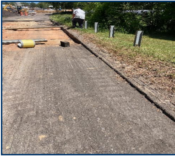
Resilient Stormwater Park Contractor removing guardrails on Moody Street.