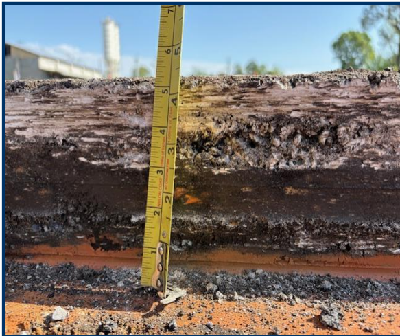
Resilient Stormwater Park VT-Verifying asphalt thickness.