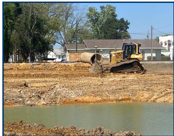
Resilient Stormwater Park Contractor grading and shaping slope for Stormwater Pond per plans.