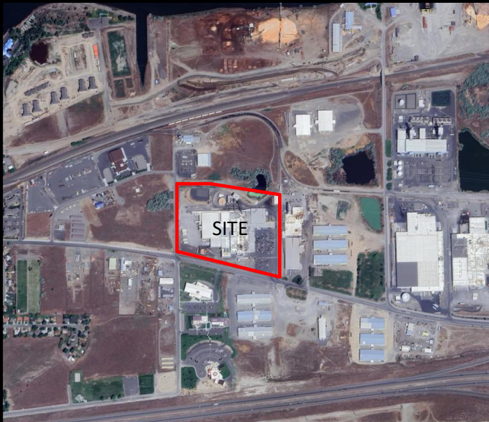
1 ARCHITECTURAL SITE PLAN 1" = 40'-0"