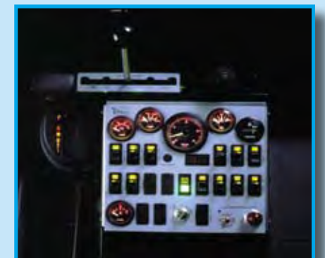
Sweeper Control Panel illuminates for easy night vision.