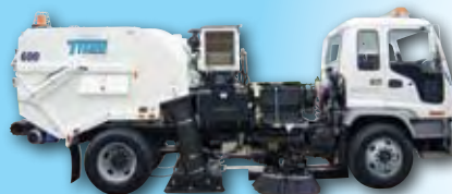
MODEL 600® Cabover