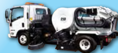
MODEL 210® Cabover

TYMCO REGENERATIVE AIR SWEEPERS are AQMD Rule 1186 Certified PM 10 -Efficient