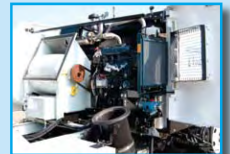
Locking side panels swing away for easy access to auxiliary engine.