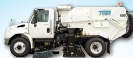
MODEL 600® Standard Cab