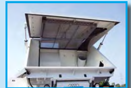
Extra large door allows for easy dumping and cleaning.