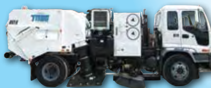
MODEL DST-6® Dustless Sweeping Technology