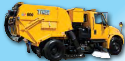
MODEL HSP® High Speed Performance for Airport Runways

Specifications subject to change without notice.