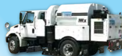
MODEL 500x® High Side Dump