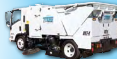
MODEL DST-4® Dustless Sweeping Technology