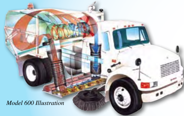
Model 600 Illustration

We want you to understand the Regenerative Air System and your TYMCO sweeper completely, so you can get optimal performance from your equipment investment. That's why, for more than twenty-five years, we've offered two-day scheduled training schools at our facility in Waco, Texas. Owners, managers, operators and mechanics get hands-on training and answers to specific questions. Enrollment levels are kept low, so you and your team will get personal attention as well as the opportunity to learn from the experiences of other attendees through the interaction of the class.