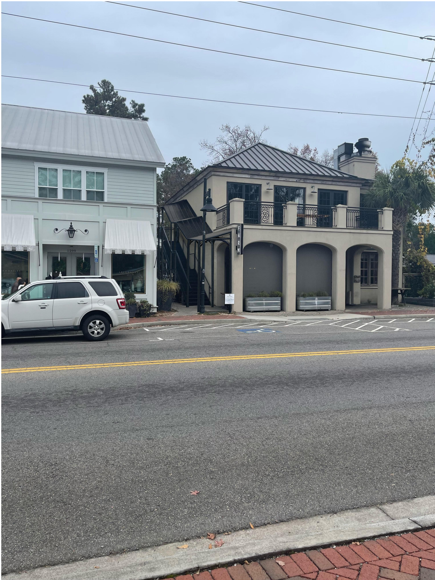
FARM STAIR ROOF December 15, 2021

REAR STAIR TO BE FINISHED TO MATCH SIDE ELEVATION.