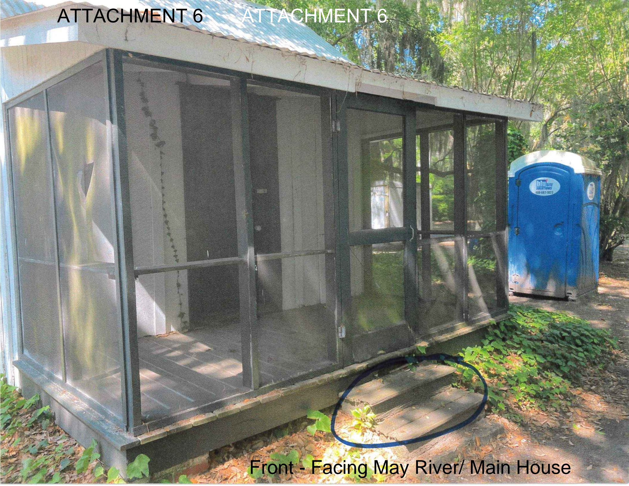
Front - Facing May River/ Main House