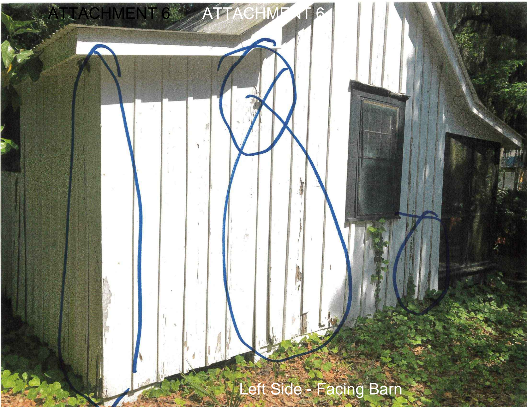
Left Side - Facing Barn