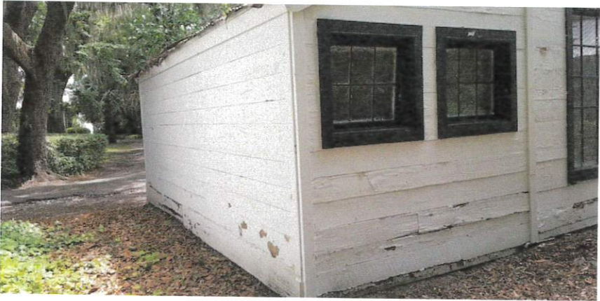
RIGHT REAR CORNER