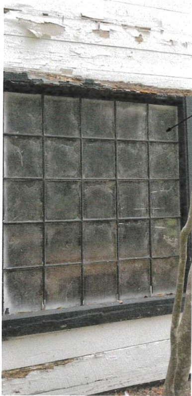
REAR WINDOW, CENTER BAY

CLEAN WINDOW PANES; TRIM TO BE REPLACED WITH SAME PROFILE