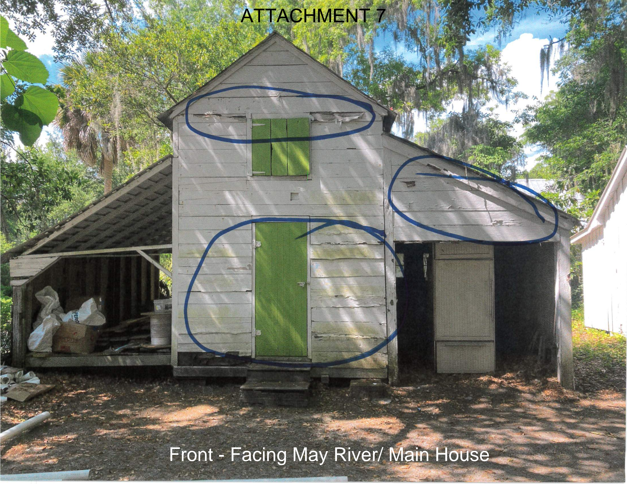
Front - Facing May River/ Main House