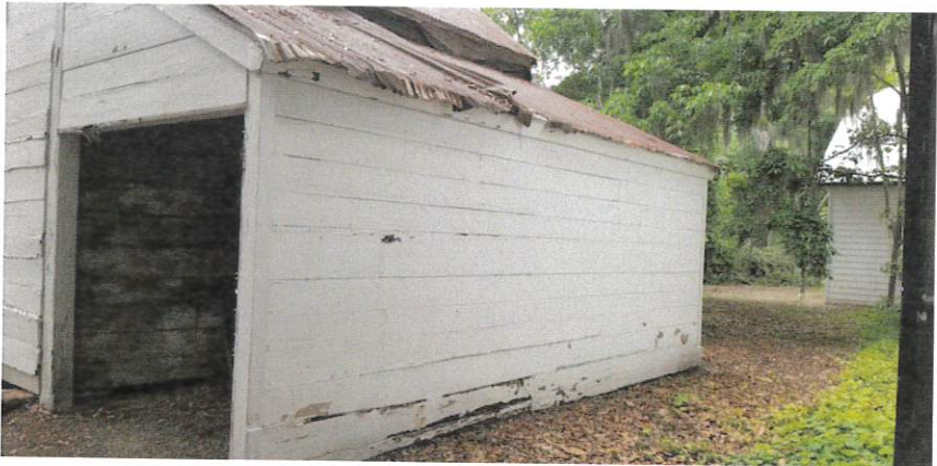
FRONT RIGHT CORNER