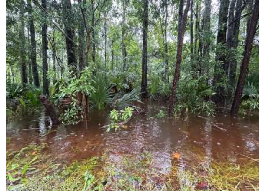
Forested Wetland in Bluffton during Tropical Storm Debbie