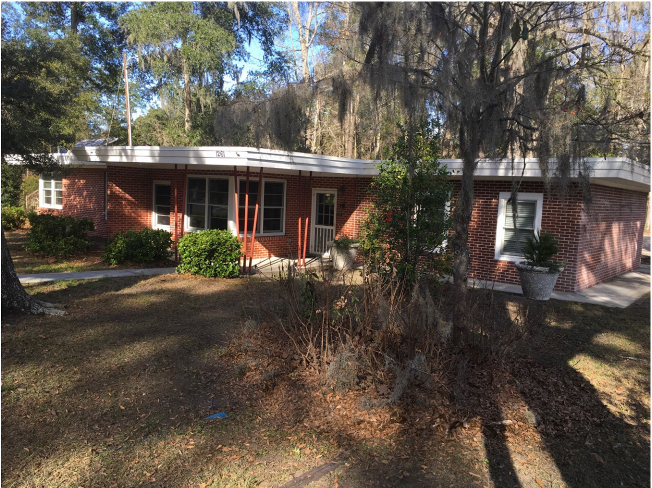
Fig. 3 1261 May River Road (southeast oblique) January 17, 2019