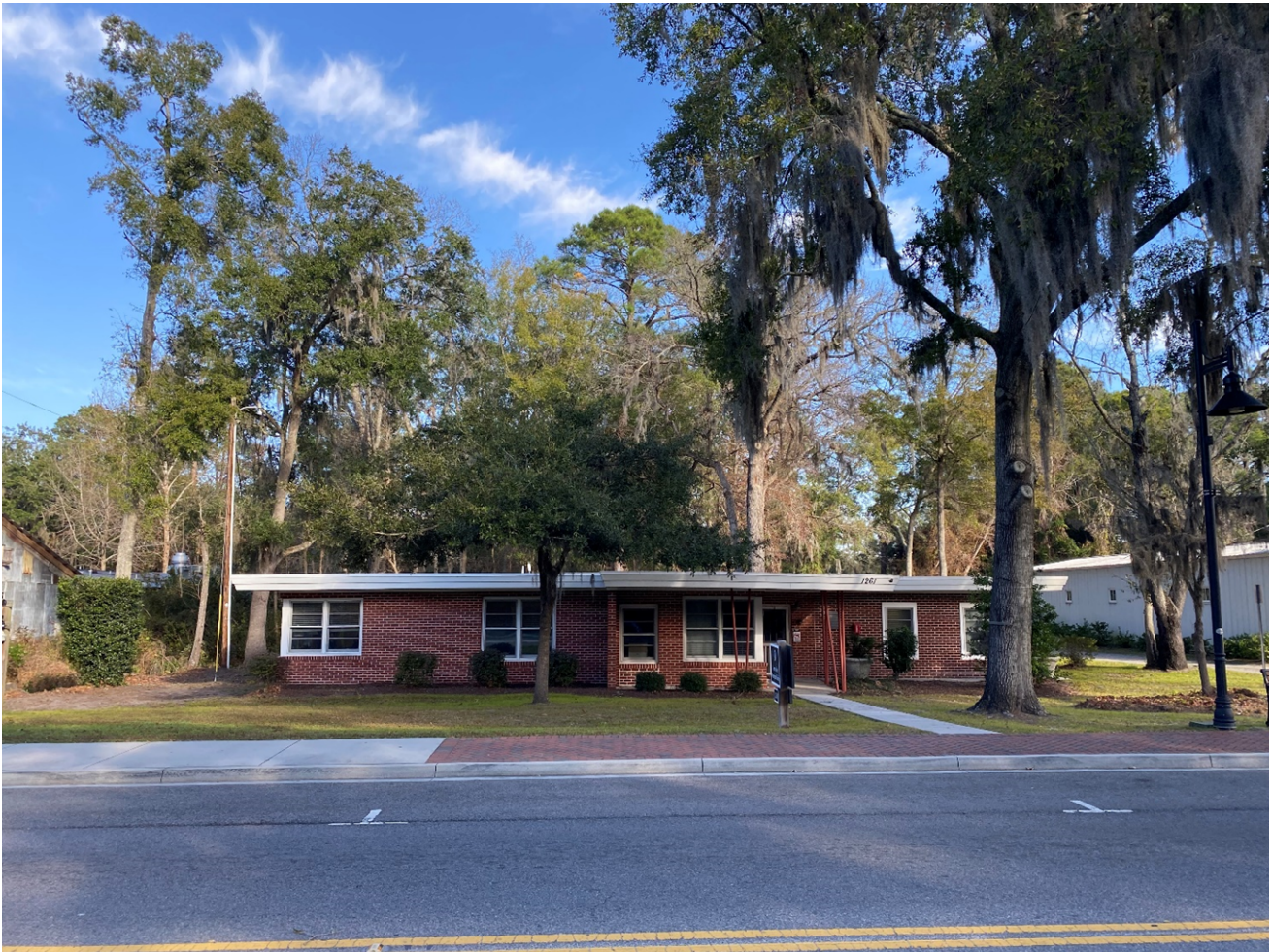
Fig. 1 Jennie Kitty Municipal Building (façade) 1261 May River Road, Bluffton, SC January 6, 2022