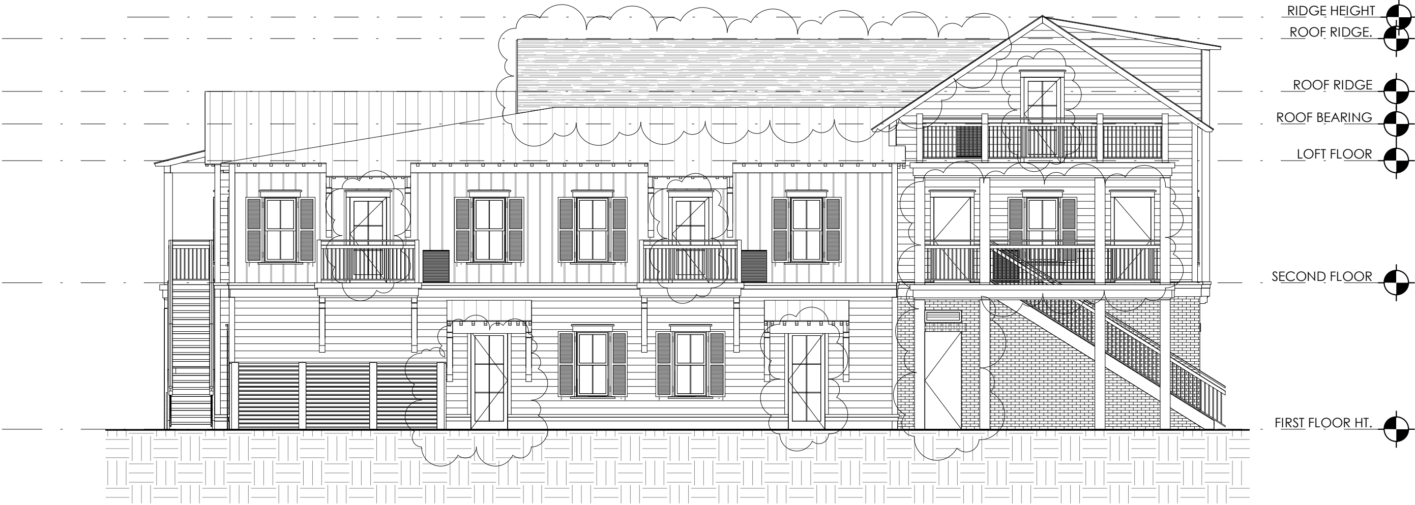
① NORTH ELEVATION 1/8" = 1'-0"