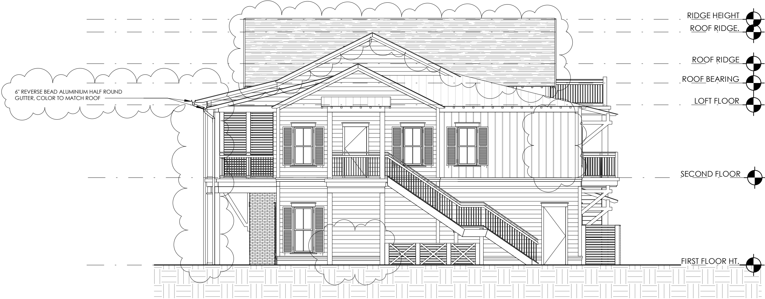
① EAST ELEVATION 1/8" = 1'-0"