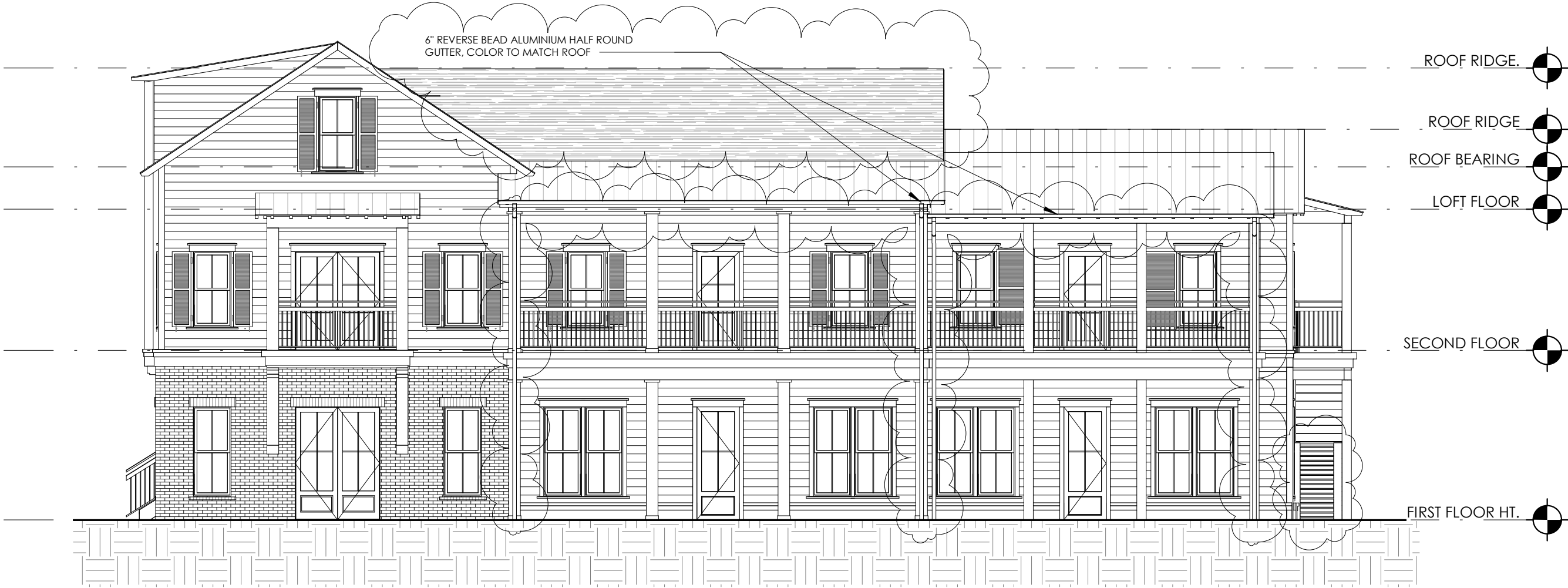
① SOUTH ELEVATION 1/8" = 1'-0"