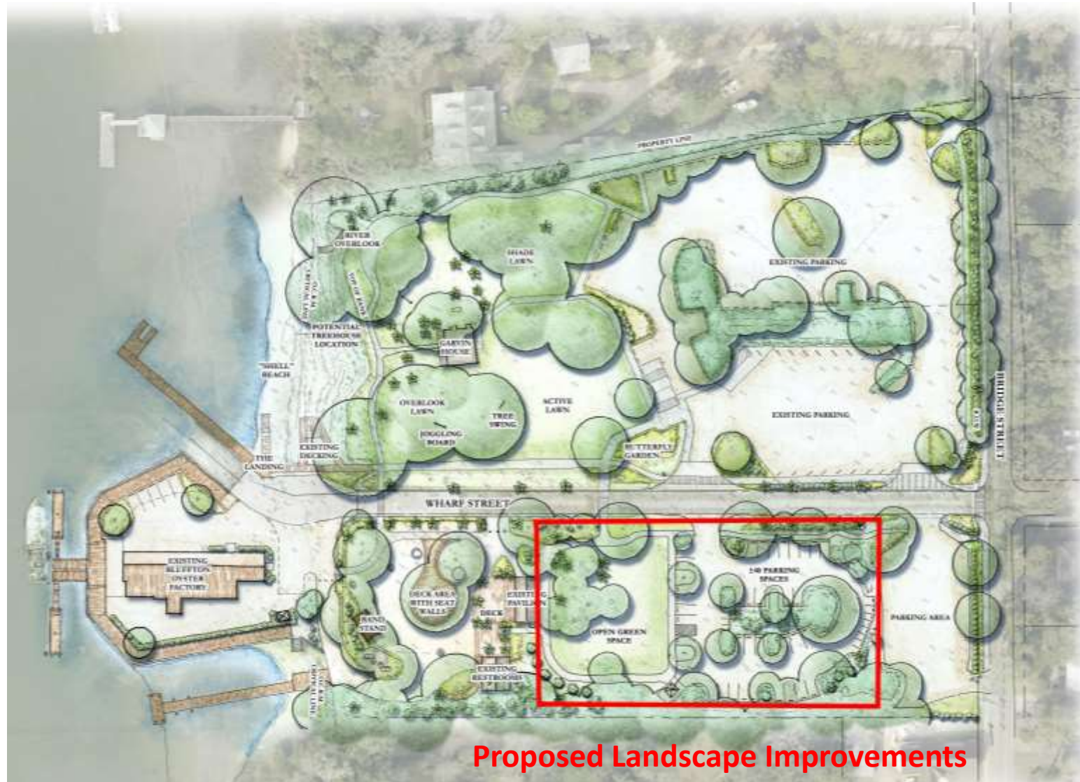
Proposed Landscape Improvements