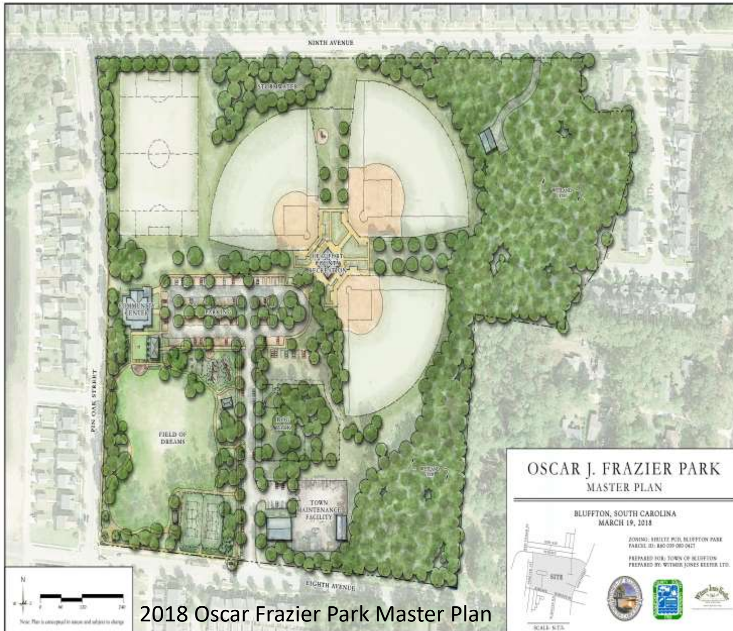
2018 Oscar Frazier Park Master Plan