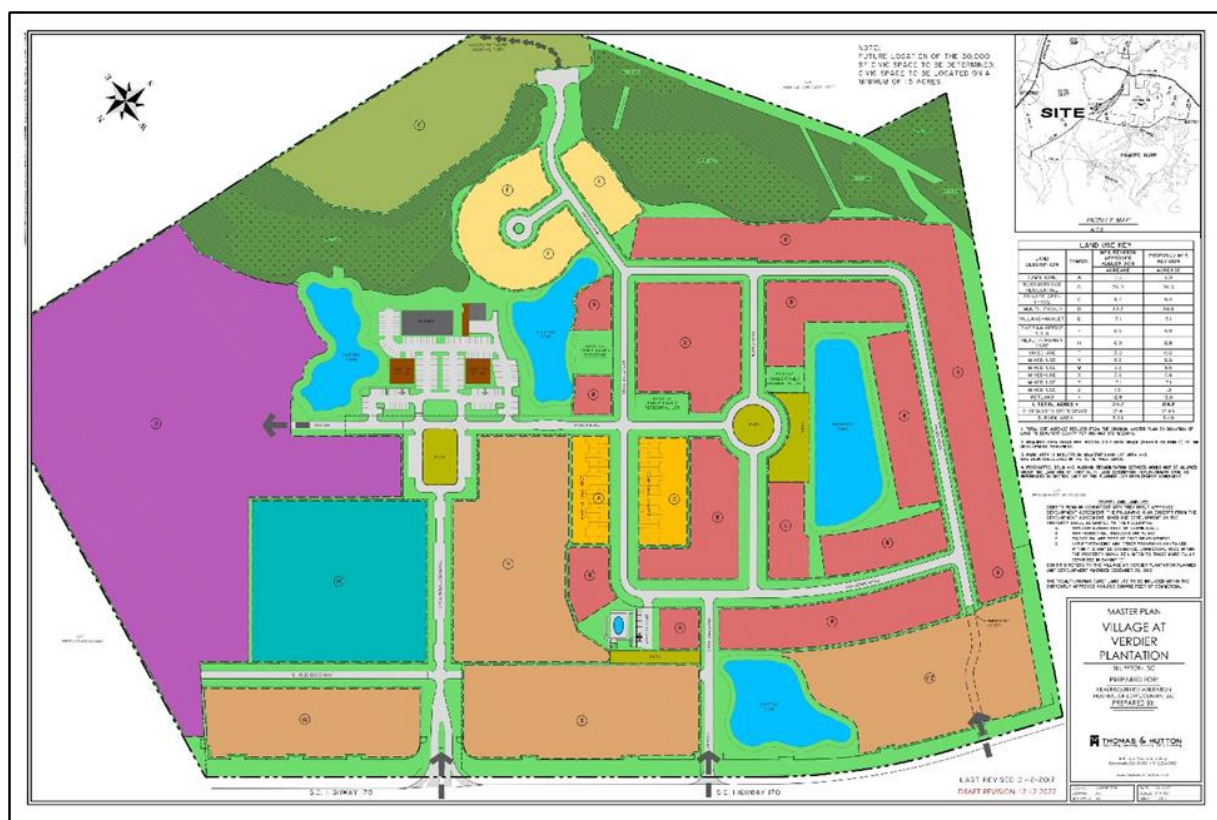
Proposed Master Plan