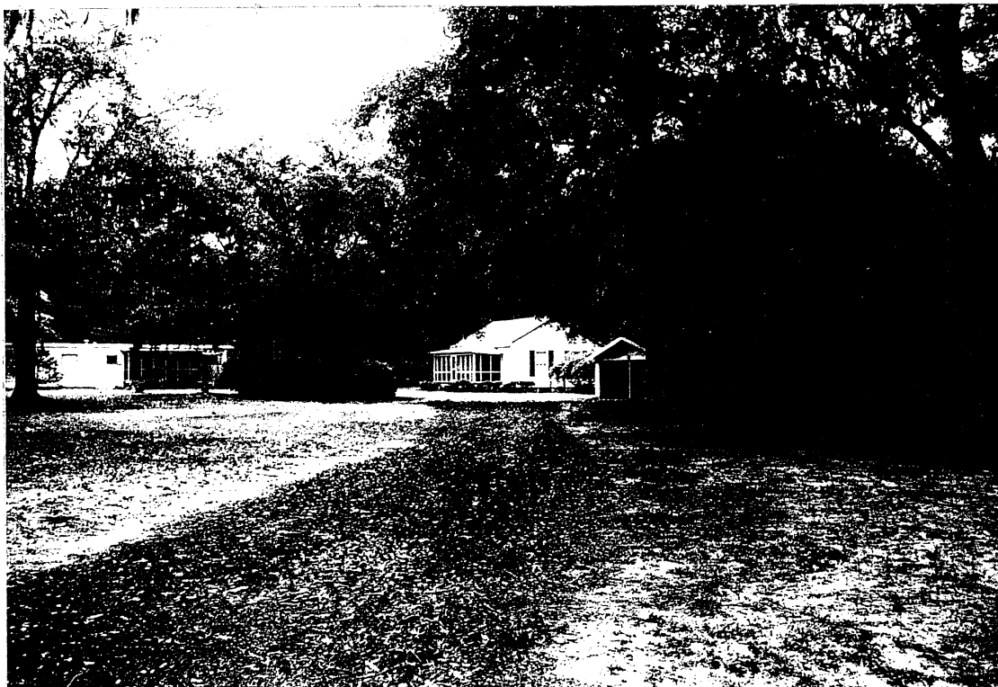
Roll No. 2, Neg. No. 35 – Northeastern Oblique