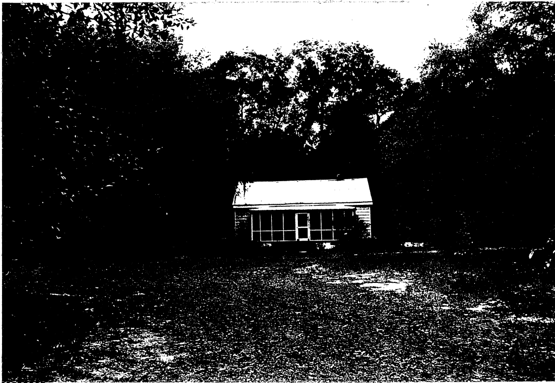
Roll No. 2, Neg. No. 36 – East Elevation