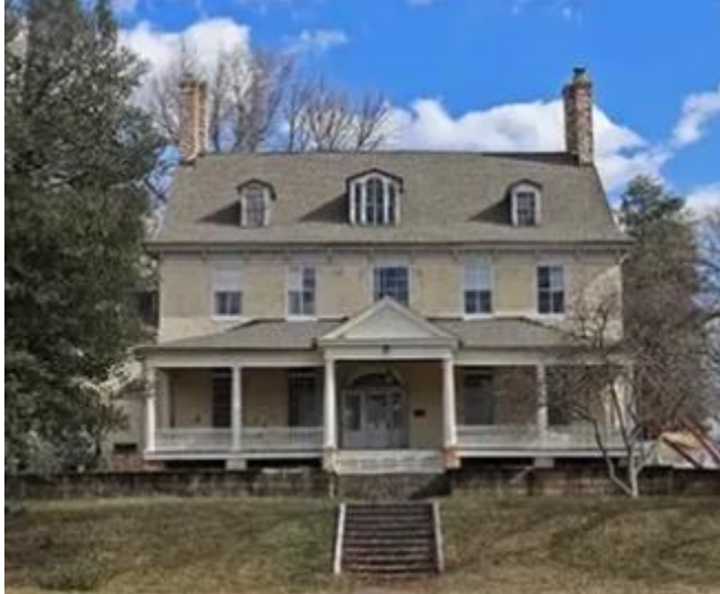
Figure 1 Aman Trust - https://amanmemorialtrust.org/

What is Bostwick House? Bostwick, a jewel of Bladensburg's history, is an eighteenth-century site in Maryland. It comprises an elegant Georgian-style main house, multiple outbuildings, and landscaped grounds. Constructed in 1746 by Christopher Lowndes, a locally prominent, English-born merchant, Bostwick is a testament to Maryland's colonial elite's wealth and aesthetic tastes. Its strategic location on the Eastern Branch of the Anacostia River made Bladensburg one of several small but important commercial centers in