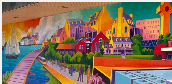
1742 Sponsor $5,000+