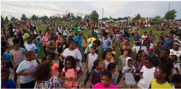
Community Sponsor $500+

Sponsoring a Bladensburg event is more than marketing, it's joining a movement that brings people together through culture, celebration, and community pride. Our events are true experiences that draw thousands and reflect the unique spirit of our historic town. From Bladensburg Day to our Fireworks Celebration, each gathering offers a vibrant opportunity to connect with families, leaders, and residents from all walks of life. Sponsors receive high-visibility recognition both in-person and across our digital platforms, including social media, email, and the town website. These events provide a chance to align your brand with values of unity, heritage, and inclusivity. It's an opportunity to be seen as a community partner, not just a business. With strong attendance and growing engagement, your support goes far and makes a lasting impact.