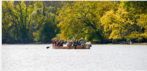
Discovery Sponsor $1,000+