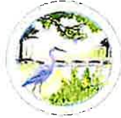
EXHIBIT A – SAMPLE DONATION ACCEPTANCE AGREEMENT