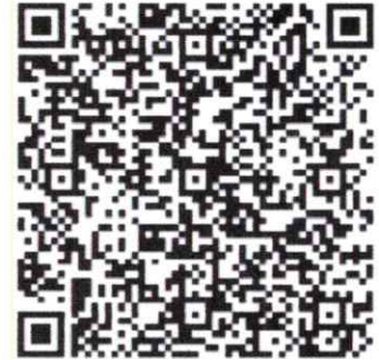
QR Code For Mobile Phone

4884 Conway Rd Unit 79 Orlando, FL 32812