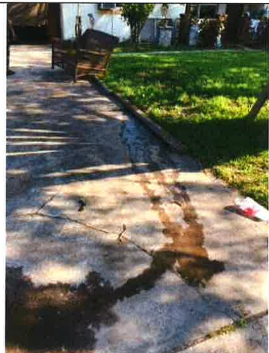
Rechecked on 9/23/2022