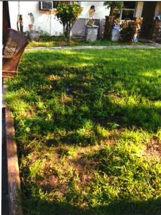
Rechecked on 9/23/2022