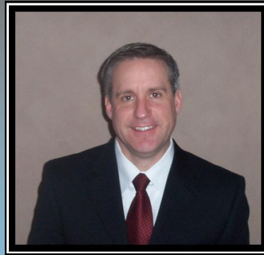
Ohio's 1 st Certified Aggregator/Broker