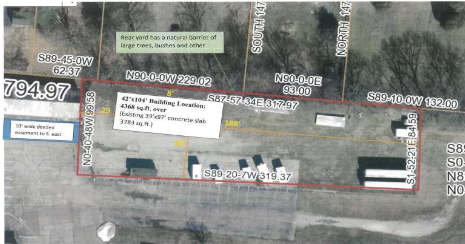
Bellbrook Lion's Storage Building Plot Plan 1