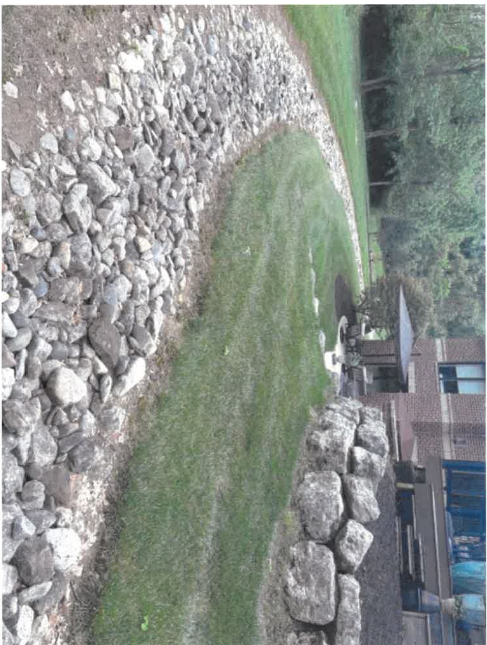
Back of house Note limited space for shed