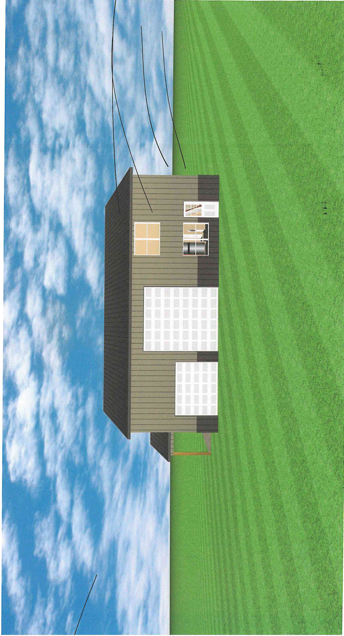
West Side Roof turned