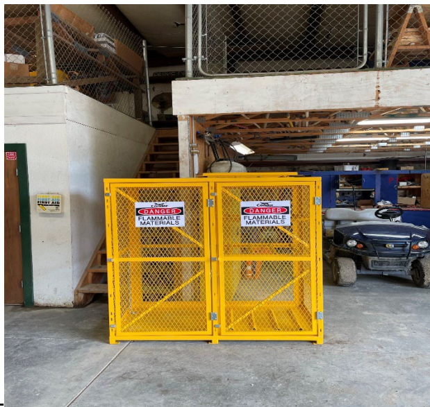
New Propane Cage for Safety storage.