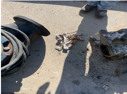
37 th And Harding Lift Station Pump