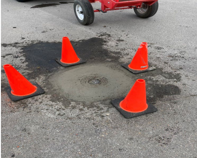
Tree Top Parking lot