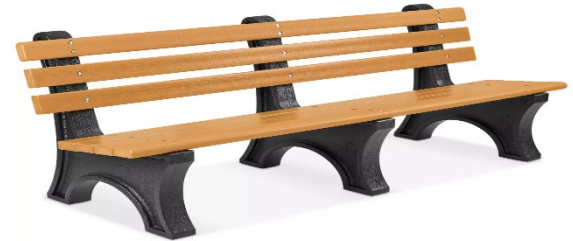
4- New park benches for Bel Aire Park