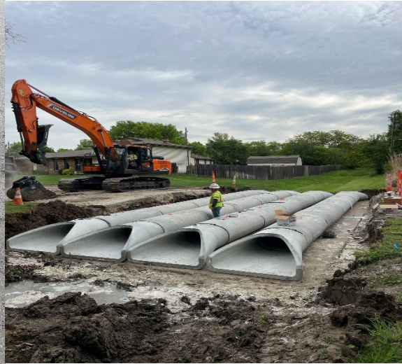
46 th and Krueger