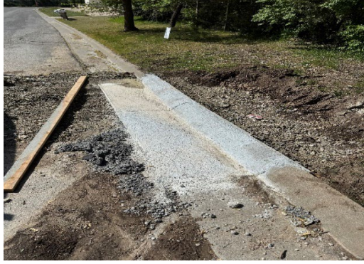
38 th and Parkwood