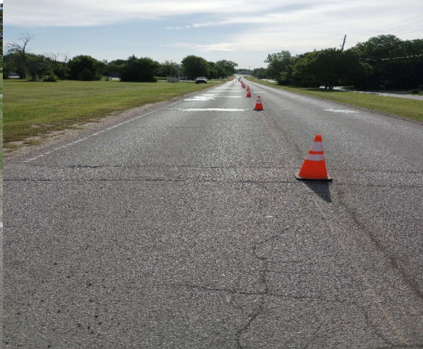
45 th Street- Mastic Repair