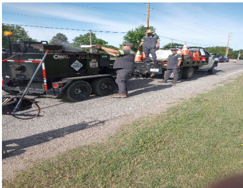
45 Street Mastic