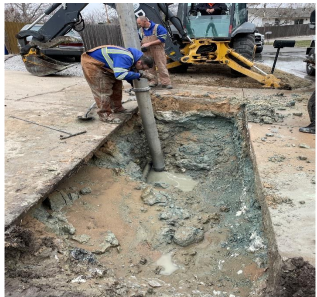
4335 Belmore water leak