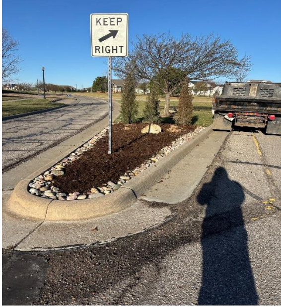
Mulching City Hall