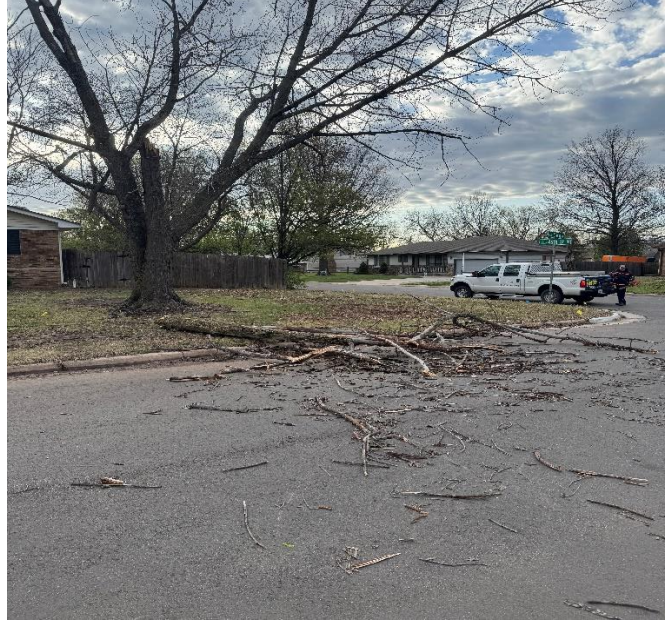
4700 Glendale Street