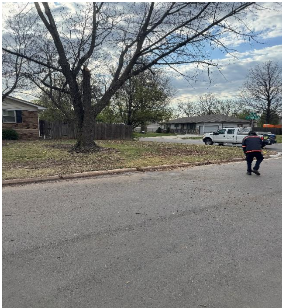
Glendale street clean up controller