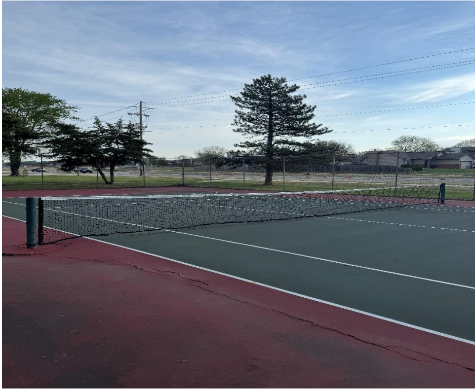
New net installed at Bel Aire Park tennis court