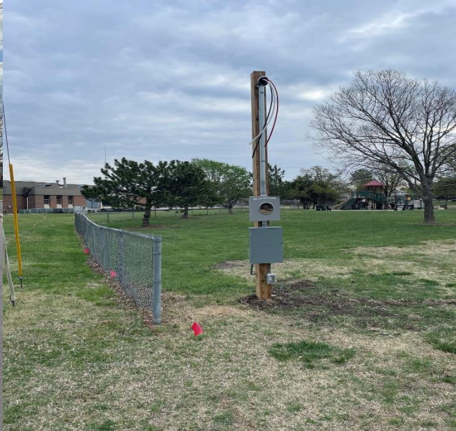
Bel Aire Park new electrical pole and sprinkler