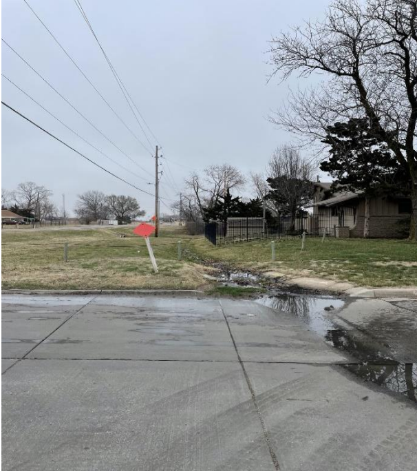
45 th and Dundee storm drain cleaning