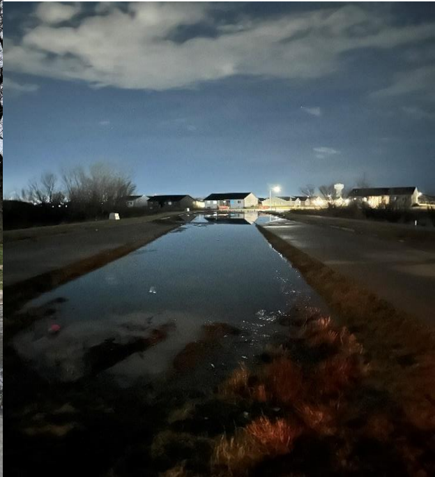
Tierra Verde flooding 3-10-26