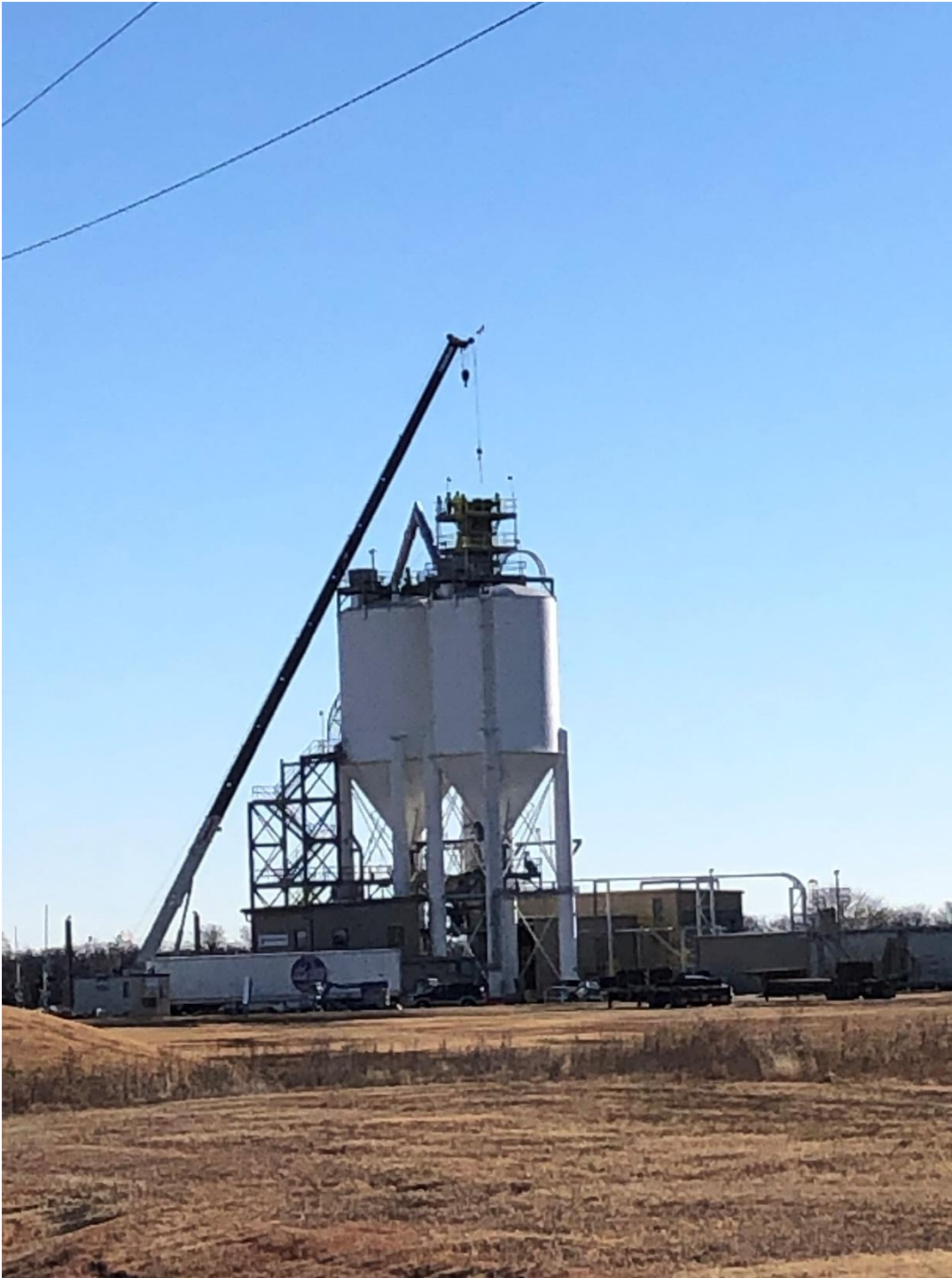
Adjusting and building the elevator required a permit from the FFA to use the crane in the airspace of Jabara Airport.