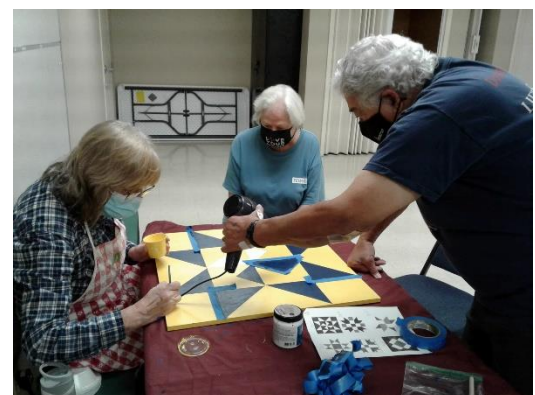
Barn Quilt Workshop