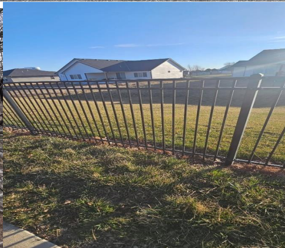
Central Park Berms New fence section