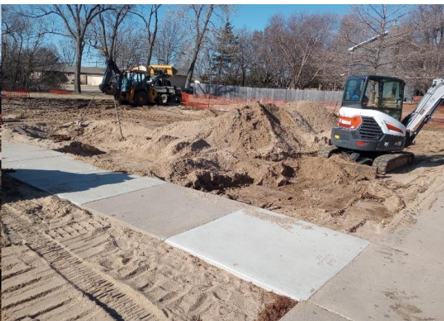
Removal of the Volleyball court at Eagle Lake