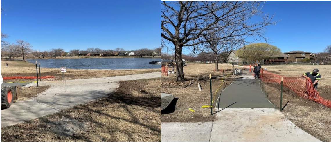
We poured several section of sidewalk at Eagle Lake.