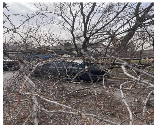
4751 Glendale pictures fence section