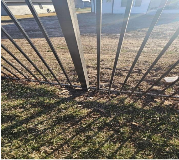
Central Park Berms New fence post Clarendon