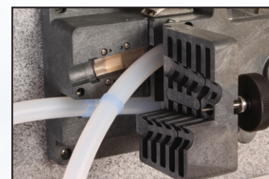
Pump Tubing Bands

Pump tubing can be replaced without tools. The safety interlock cuts power whenever the pump band is unlocked, preventing any accidents while maintaining, repairing or changing tubes. Heat resistors on the control panel keep condensation from developing on the circuit board, eliminating the need for desiccant and desiccator maintenance.