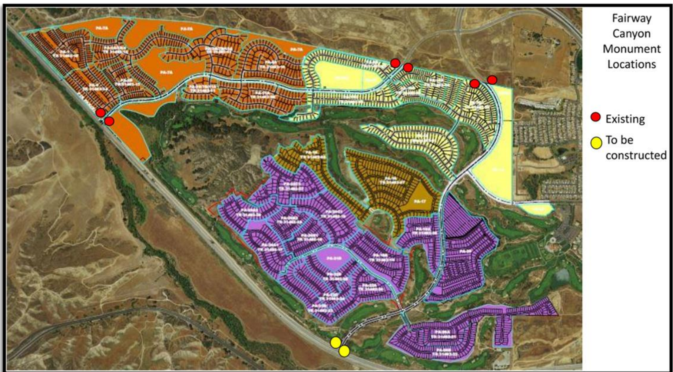
Figure 1- Monument Location