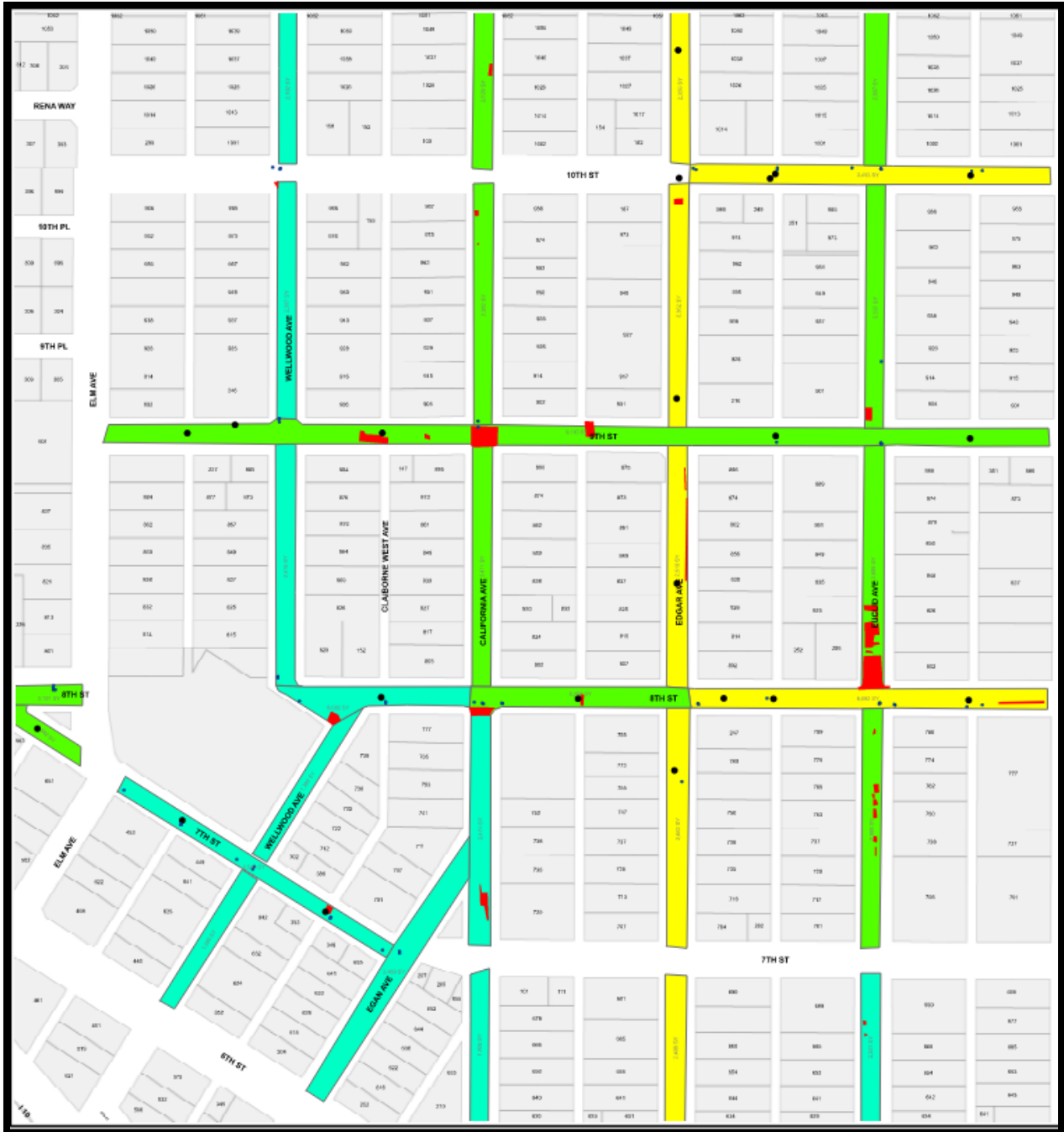
Figure 3- Area C