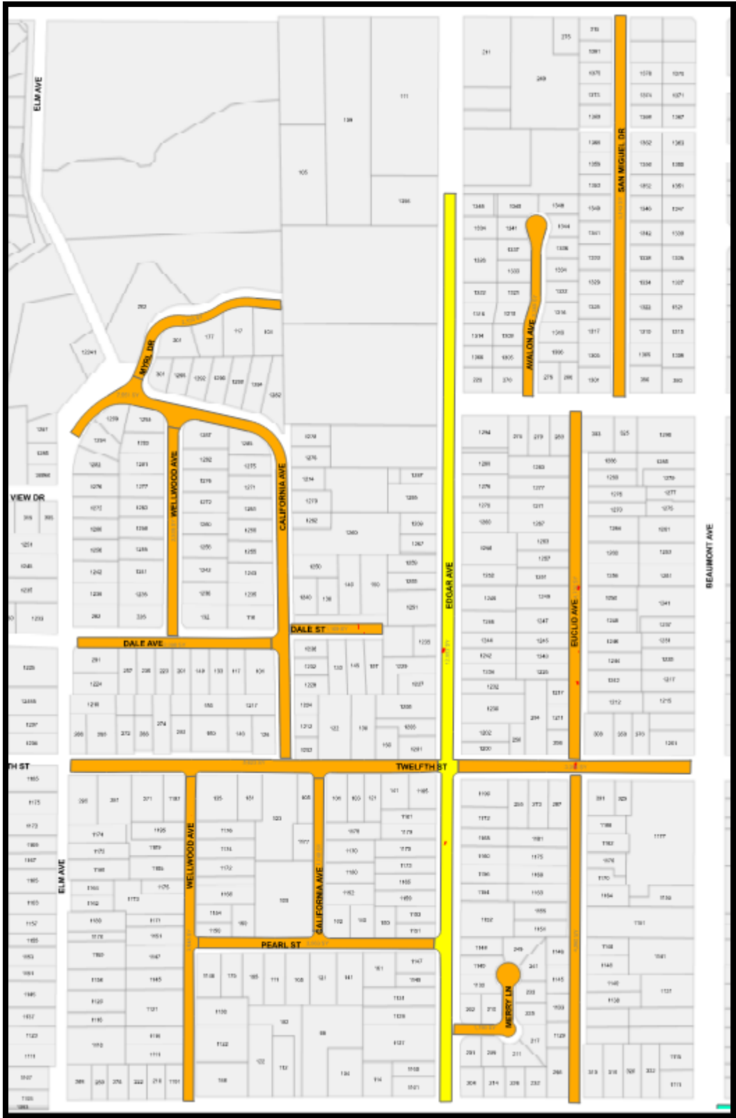
Figure 2- Area B