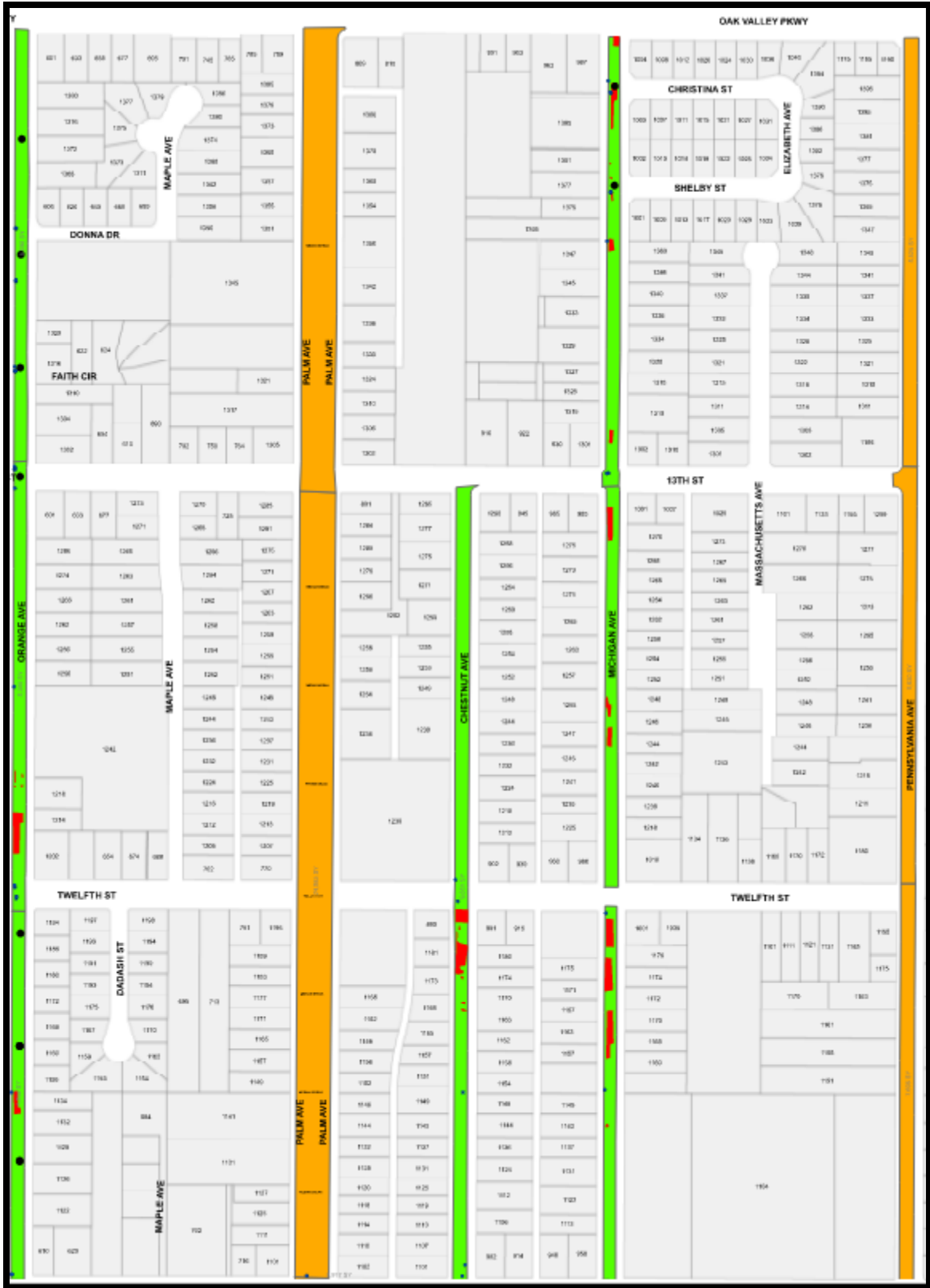
Figure 5- Area E