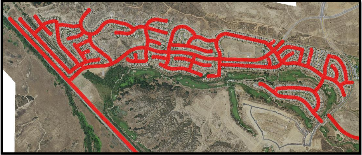
Figure 2 - Portion of Fairway Canyon Community

As part of the ongoing maintenance on City streets, the Annual Citywide Street Rehabilitation and Maintenance 20/21 project and the Annual Citywide Street Rehabilitation and Maintenance 21/22 project will extend the life of existing streets based on the treatment method.