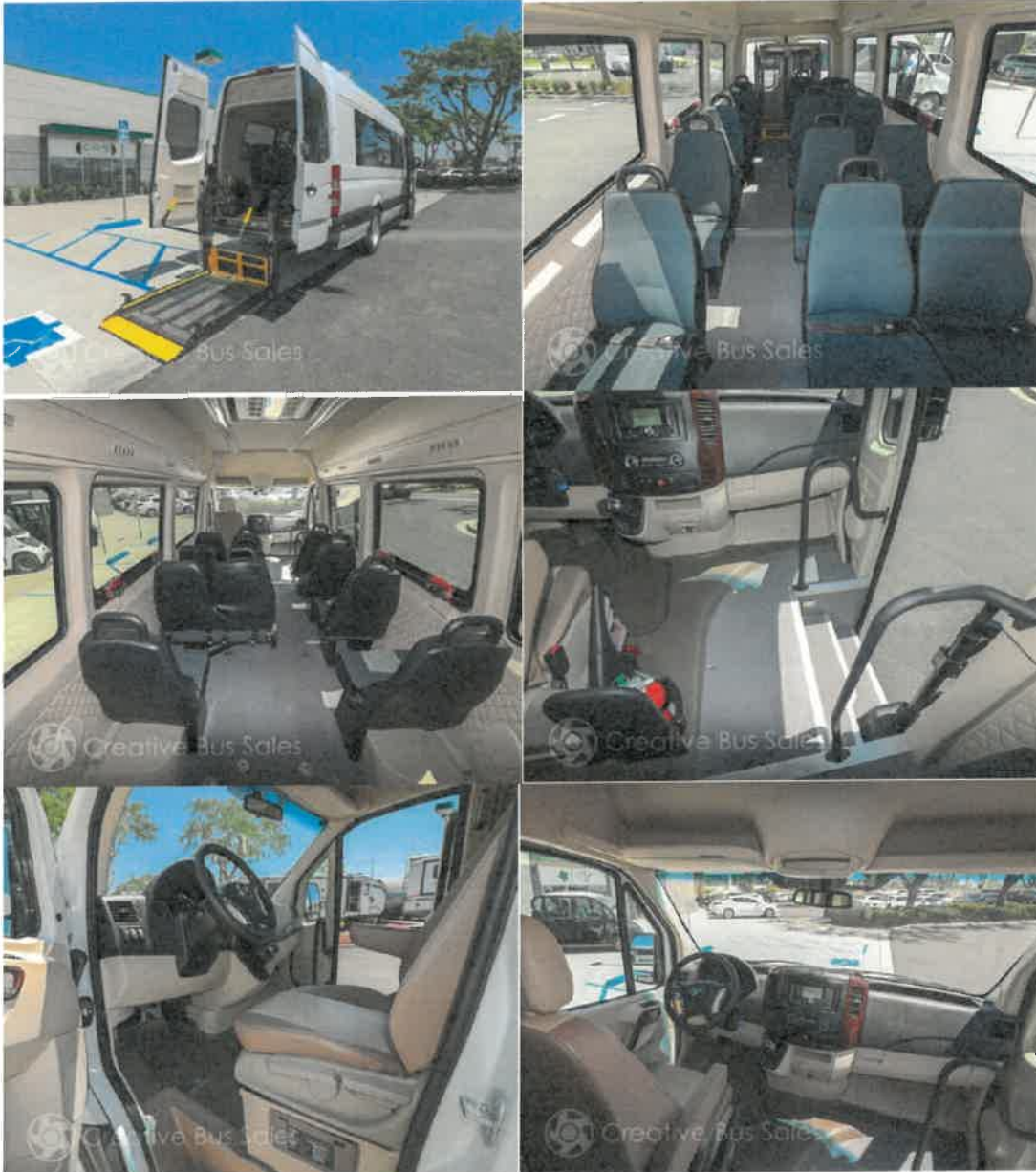
*Photos of similar model with optional equipment.