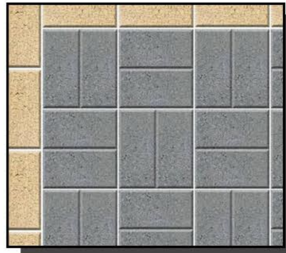
BASKET WEAVE CONCRETE BRICK PAVERS AT EXTENDED PLAZA