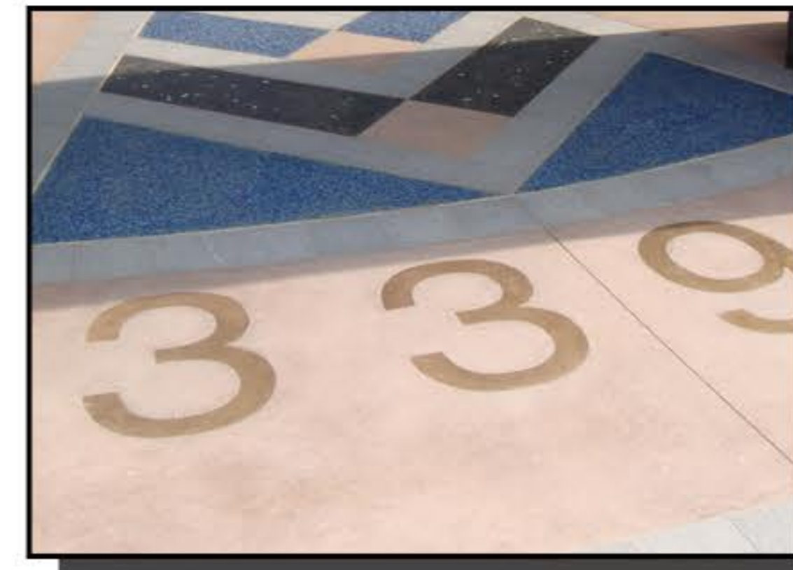
BRONZE INLAY NUMBERING OF INCORPORATION DATE