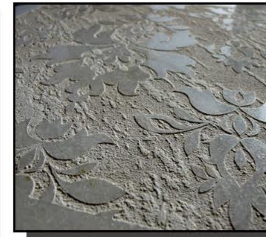
ETCHED PAVING DESIGN OPTION FOR CITY LOGO