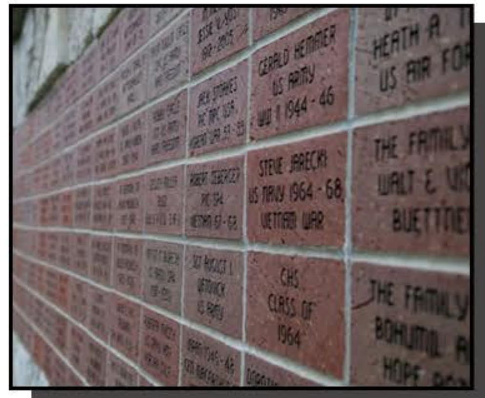
MEMORIAL DONOR BRICK WALL