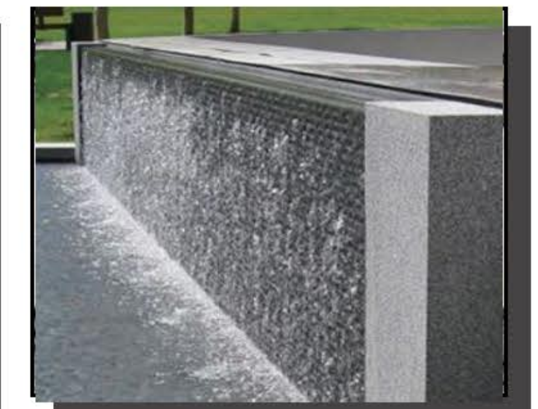
GRANITE MEMORIAL WATER FEATURE