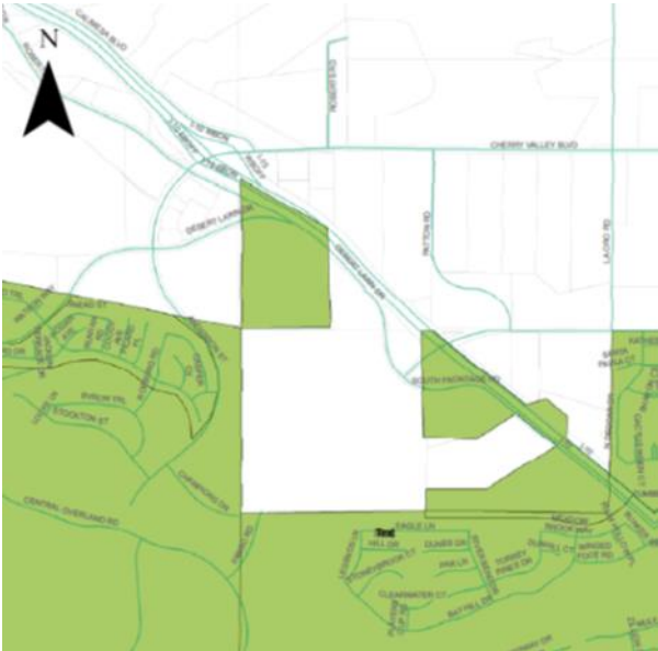
Figure 2 – BCVWD Boundary Map

This parcel is currently in the Beaumont Cherry Valley Water District (BCVWD) service area and service to this property is included in their long-term plan. Yucaipa Valley Water District has indicated they are not interested in serving this property without serving both water and wastewater. Figure 2 below shows the existing service boundary of BCVWD and indicates that the subject tract is located within BCVWD District 3.