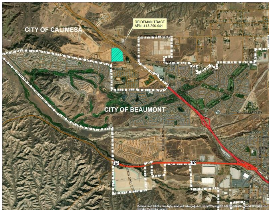
Figure 1- Location of Property

DR Horton Homes is currently in escrow to purchase approximately 44 acres (APN 413-290-041) located adjacent to Desert Lawn Drive and in the City of Calimesa. The City of Calimesa does not provide utilities within their jurisdiction and as such this property is not in the service area of any wastewater provider at this time. As a result, DR Horton has requested that the City of Beaumont consider providing residential wastewater service for approximately 200 homes.