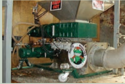
Optional roller base makes moving the system quick and easy