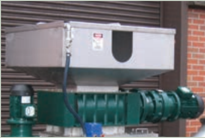
Custom hopper sizes and hopper covers