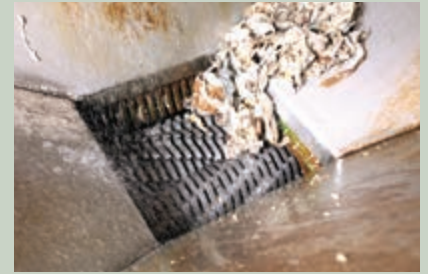
Rags and trash are flushed into the cutters, where grinding and washing dislodge fecal matter.