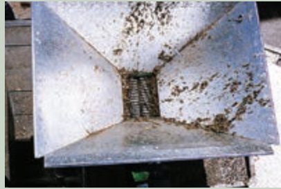
Custom hopper variation