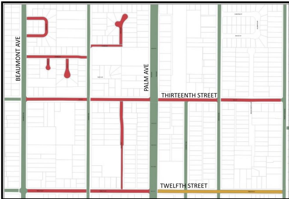
Figure 2 - Portion of Town Center Community