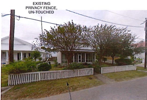
EXISTING PRIVACY FENCE, UN-TOUCHED