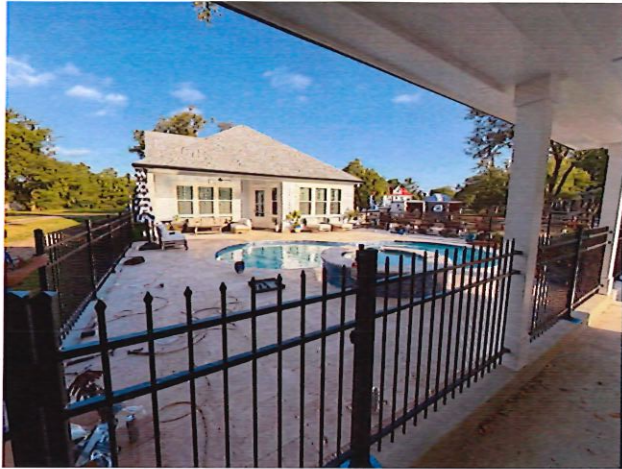
EXAMPLE OF NEW FENCING TO BE USED - 4'x6' TALL ALUMINUM FENCING (4' TALL PANEL SHOWN)