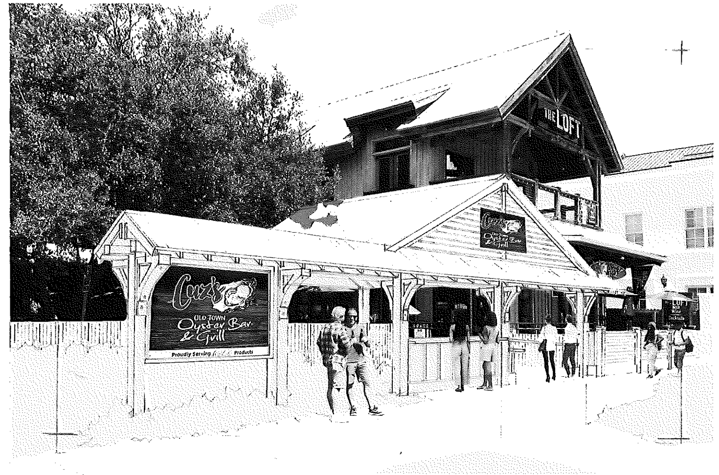
VIEW FROM BEACH BOULEVARD