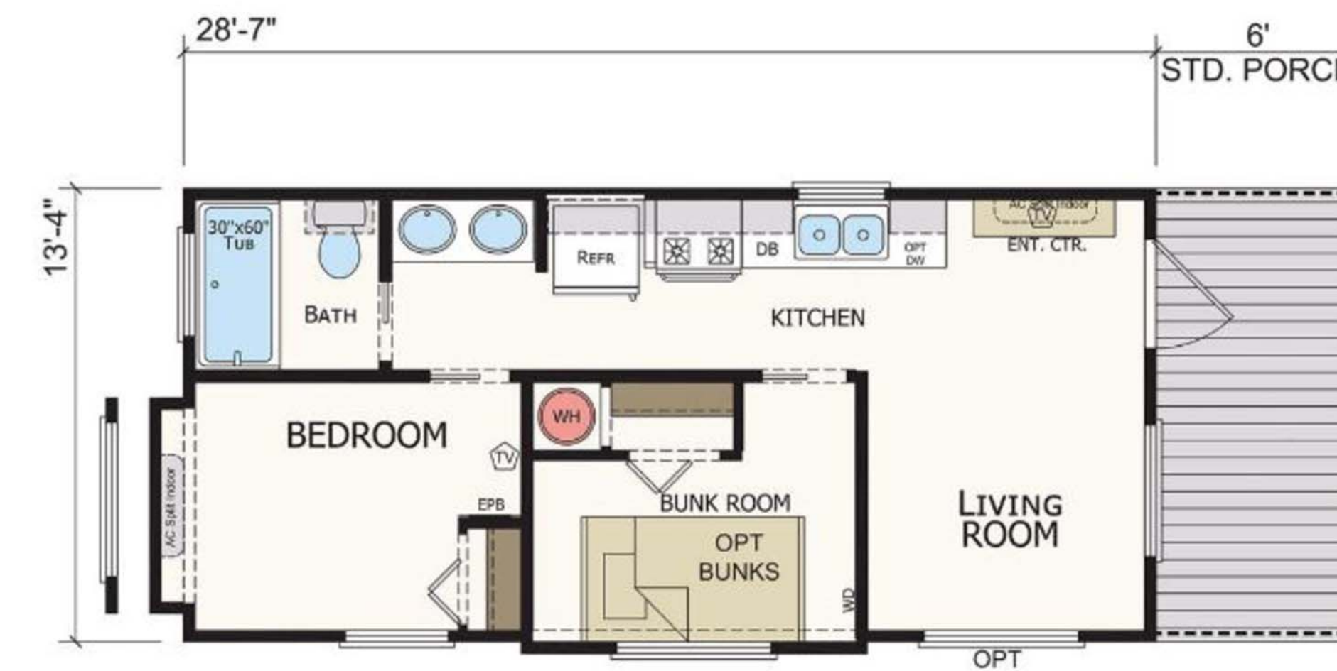
3 UNIT FLOOR PLAN 1/4"=1'-0"