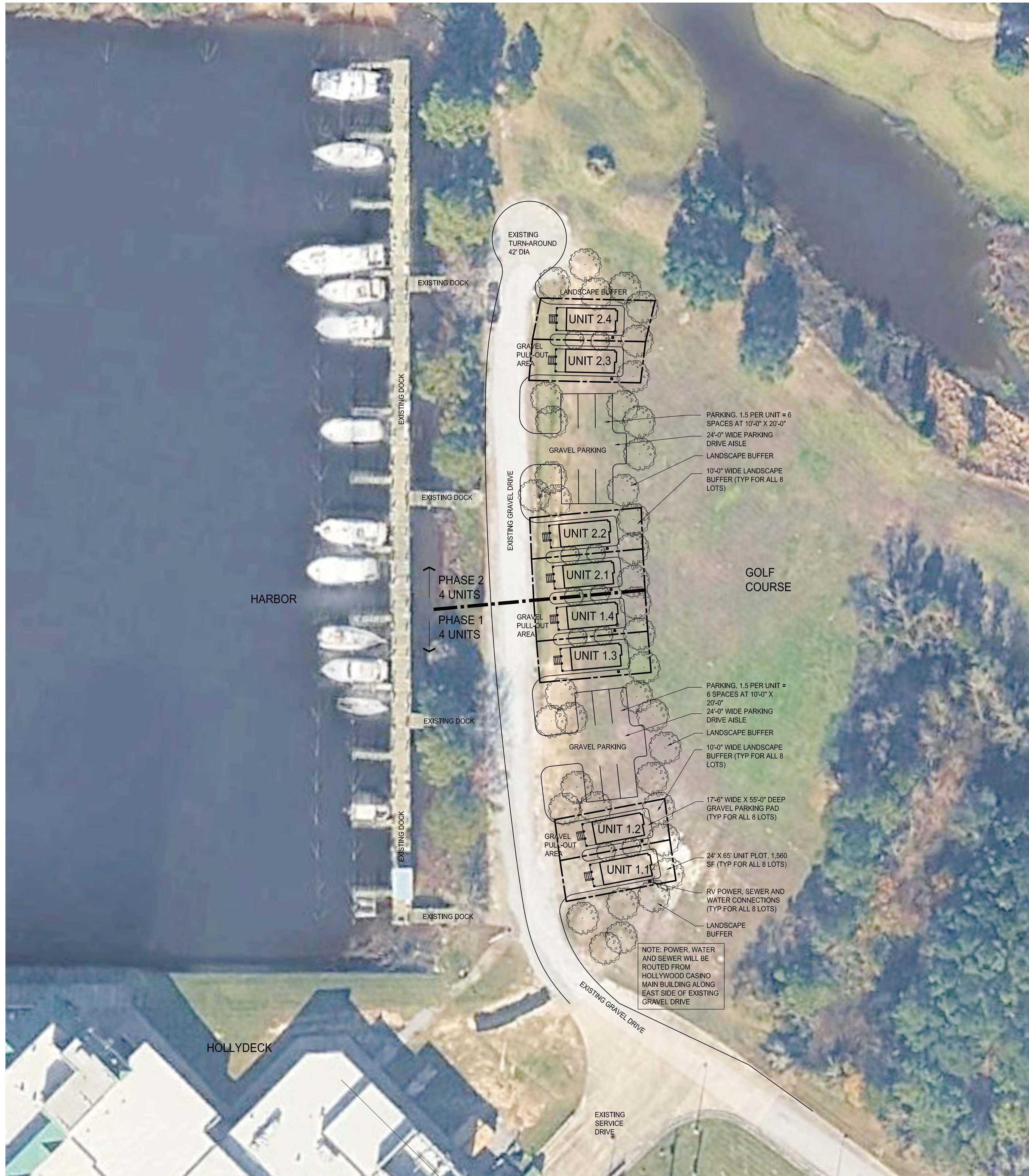
2 RV PARK SITE PLAN 1"=32'-0"