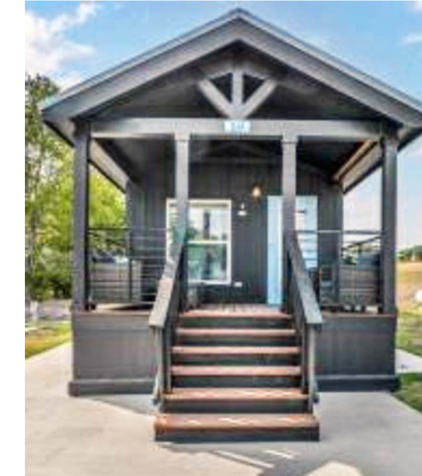
FRONT VIEW - NOTE THAT UNITS WILL NOT HAVE BASE SKIRTING INSTALLED