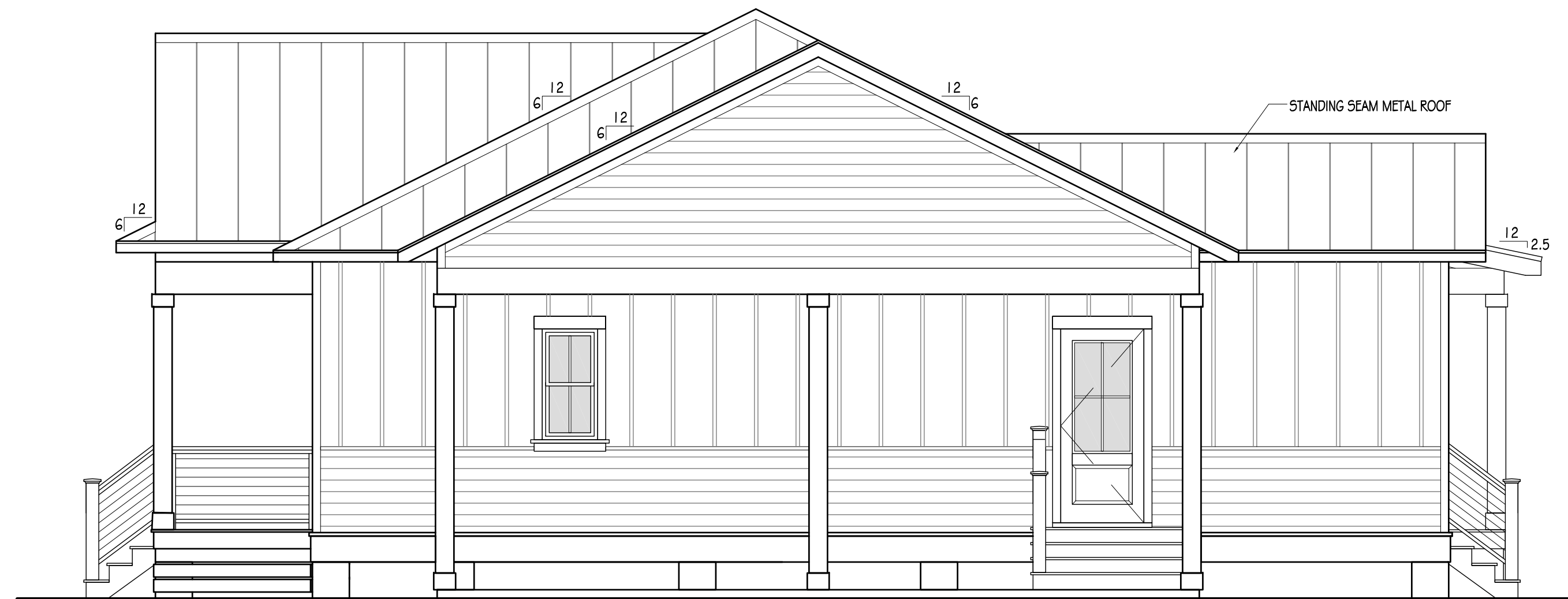
2 WEST ELEVATION Scale: 1/4"=1'-0"