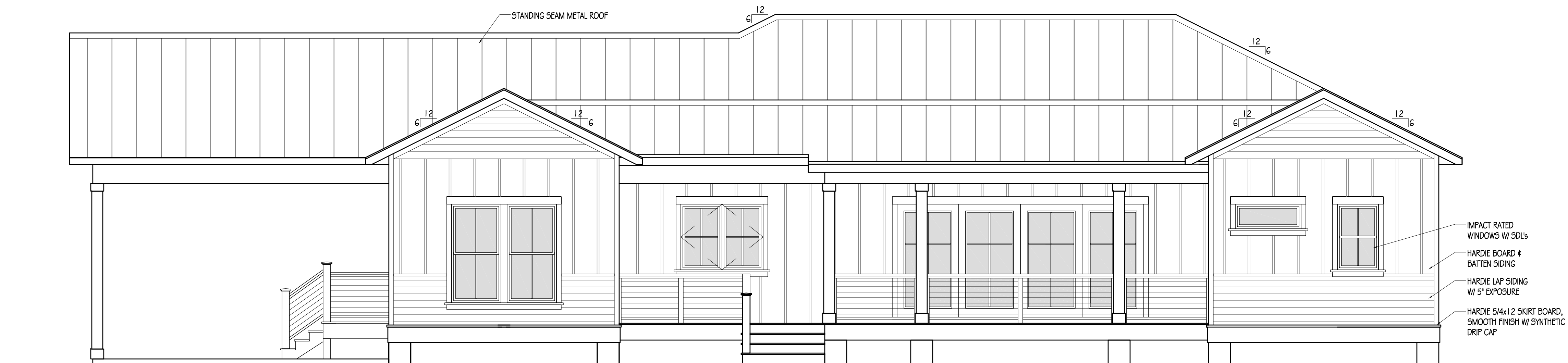
3 REAR ELEVATION Scale: 1/4"=1'-0"