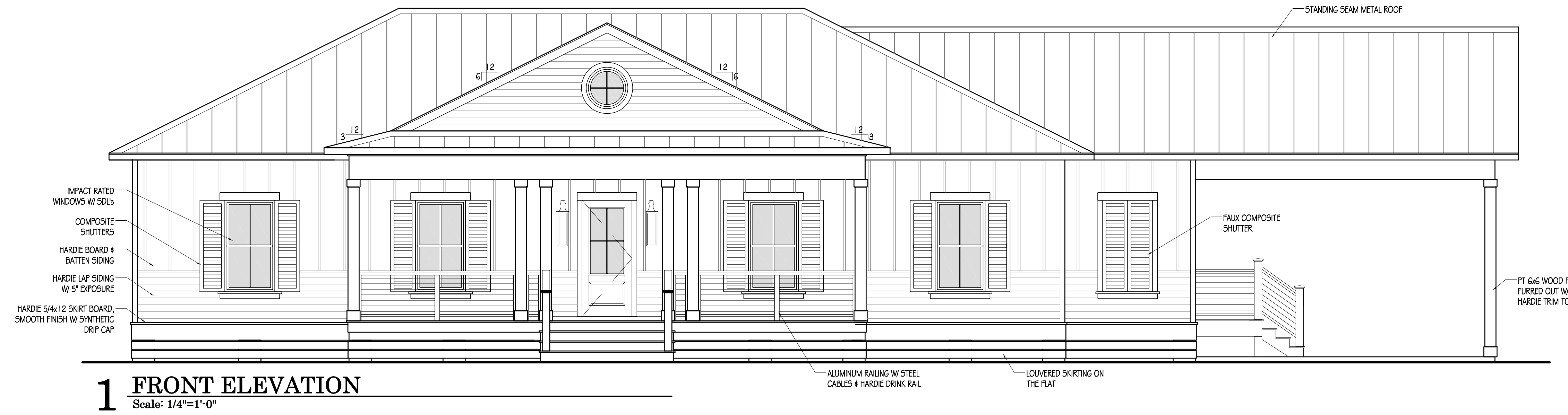
1 FRONT ELEVATION Scale: 1/4"=1'-0"