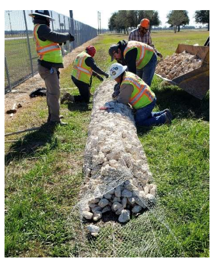
Figure 1- Installation of Filter Dam