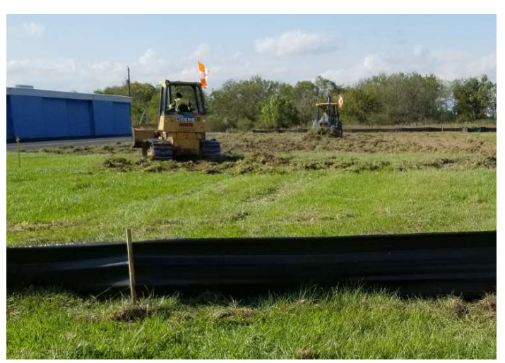
Figure 2 - Stripping topsoil for grading