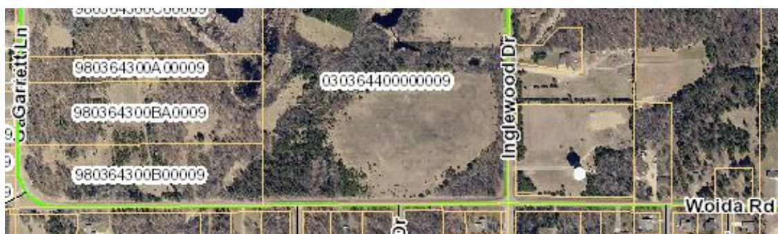
Wolda Road (West of Ingleswood Dr.)