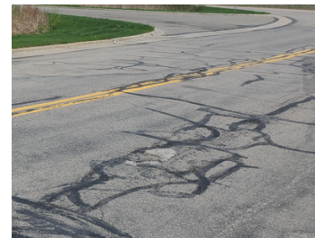
Audubon Way, May 2024