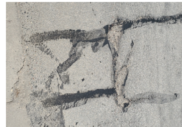
Whispering Woods Lane, May 2024