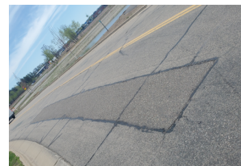
Edgewood Drive, May 2024