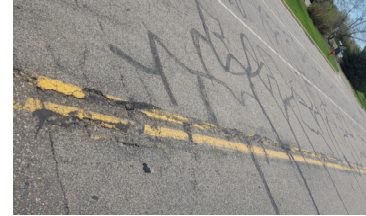
Lake Forest Road, May 2024